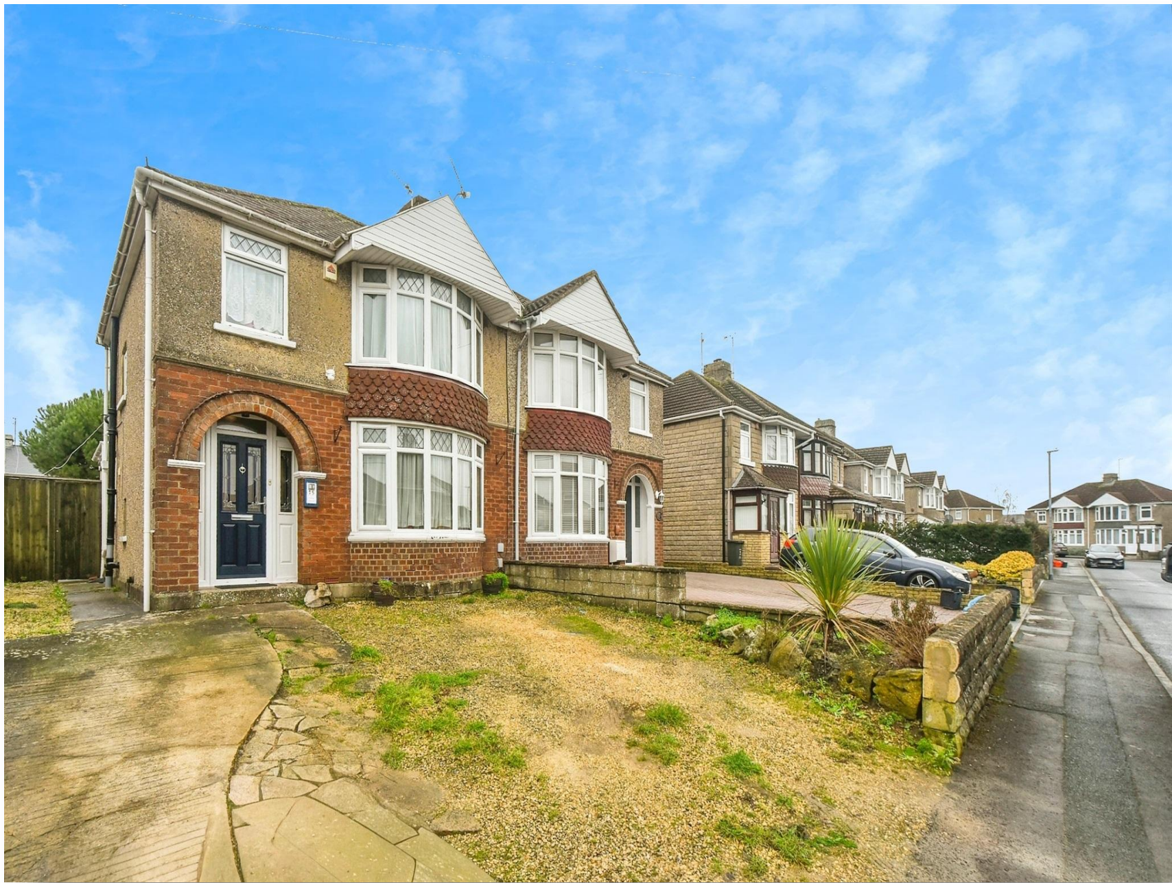
Okus Grove ,Swindon SN2 7QA