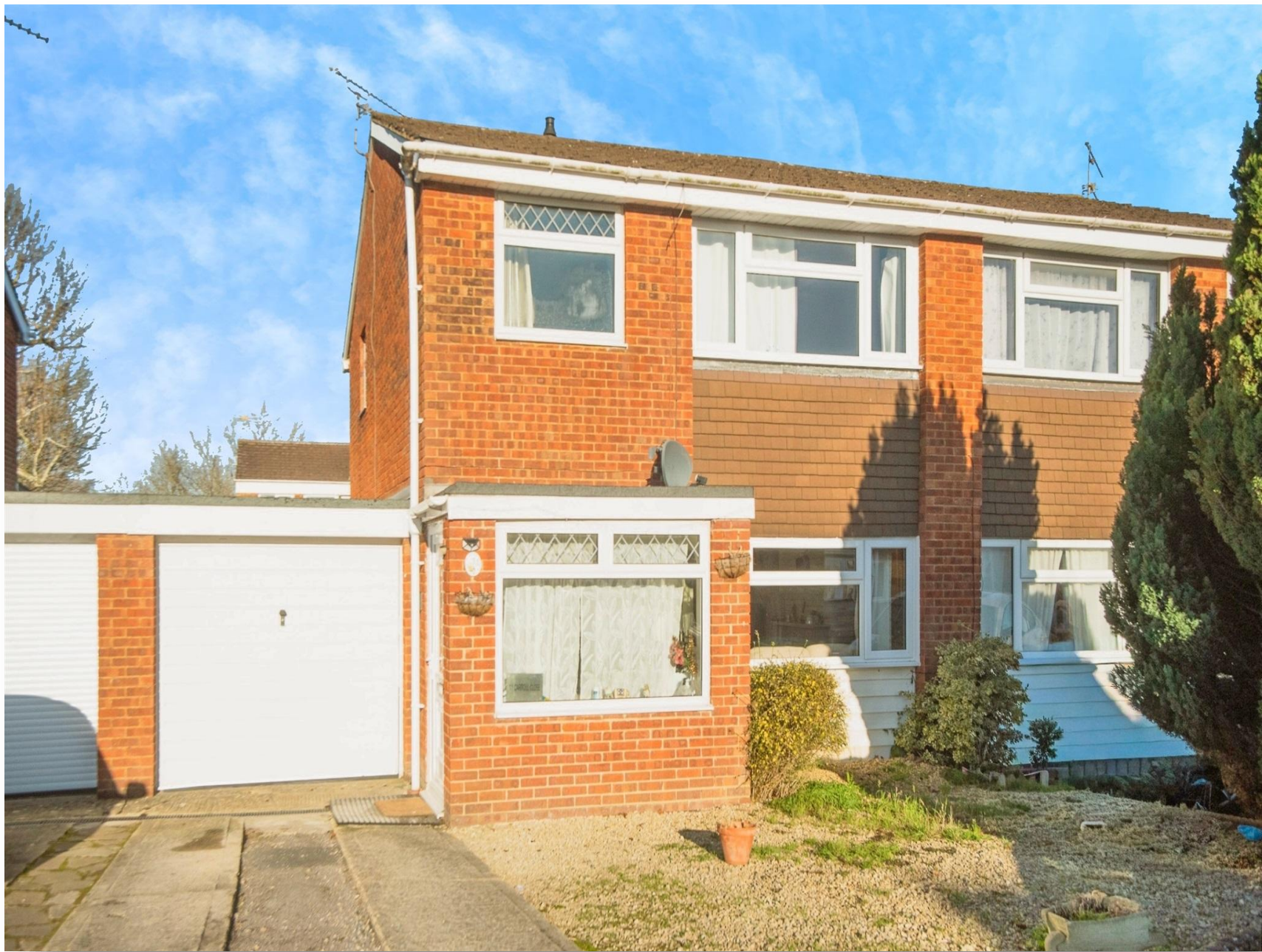
Carroll Close, SWINDON SN3 6JH