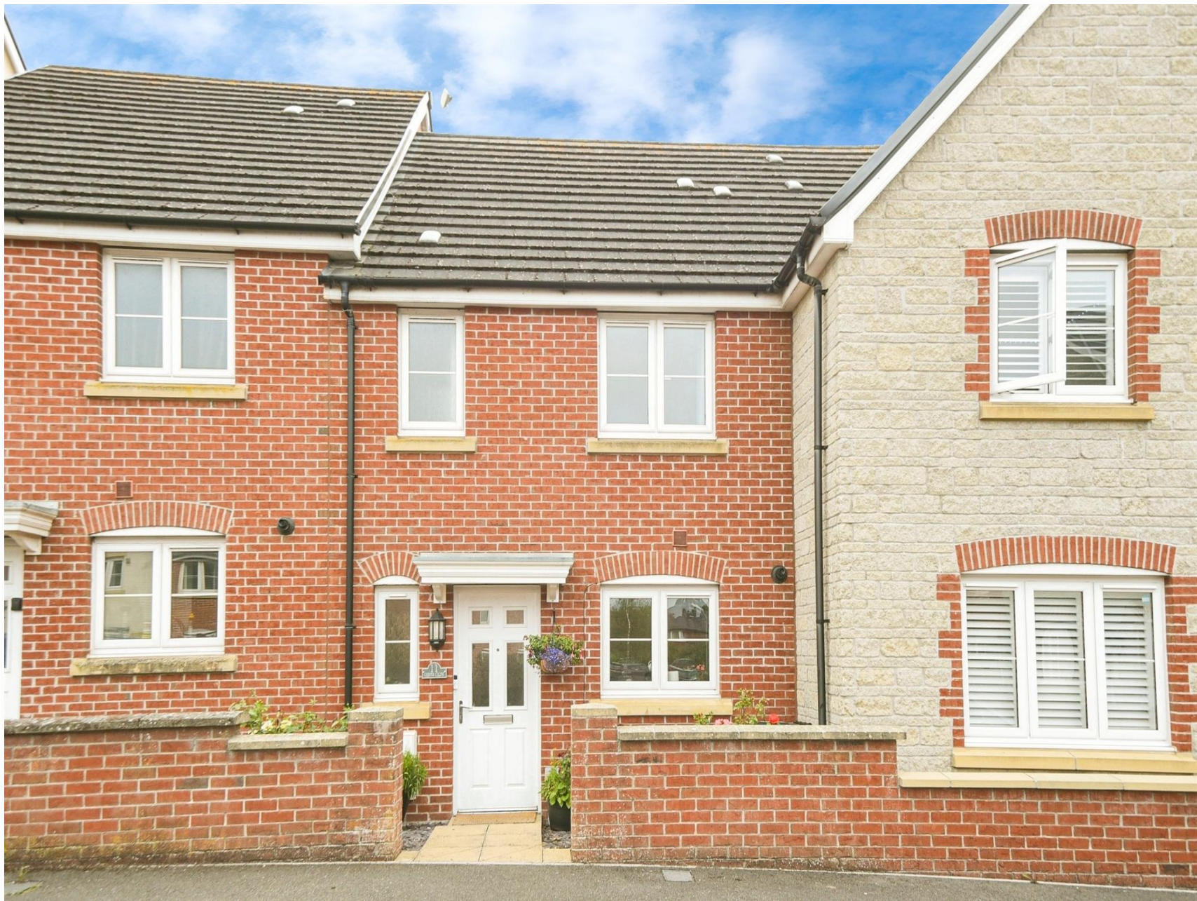
Carver Close ,Swindon SN3 4GJ