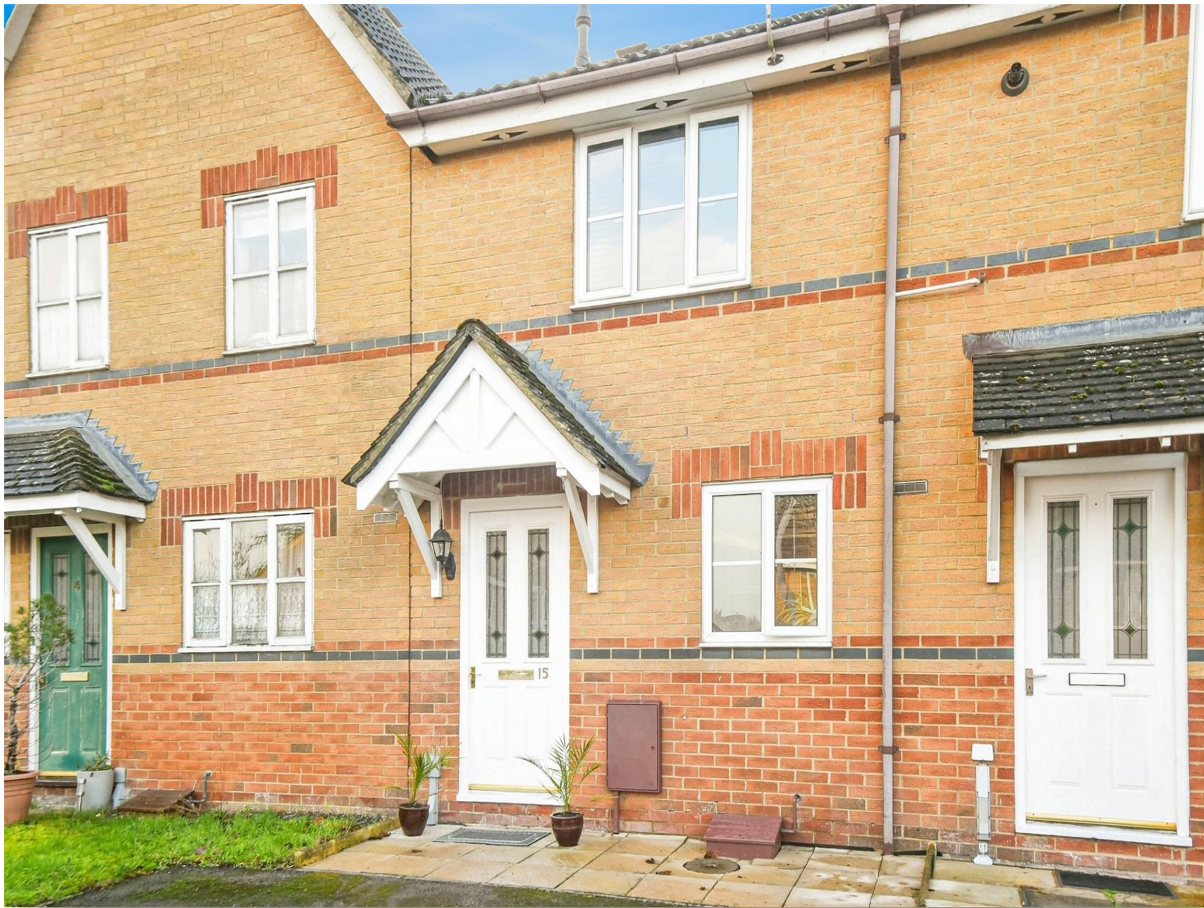
Jole Close, Swindon SN2 7WD