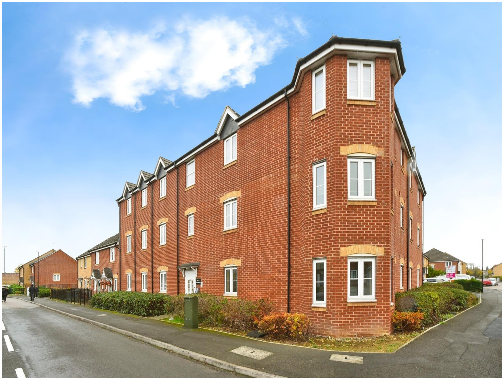
Flat 7 Horsham Road, Swindon SN3 2FL