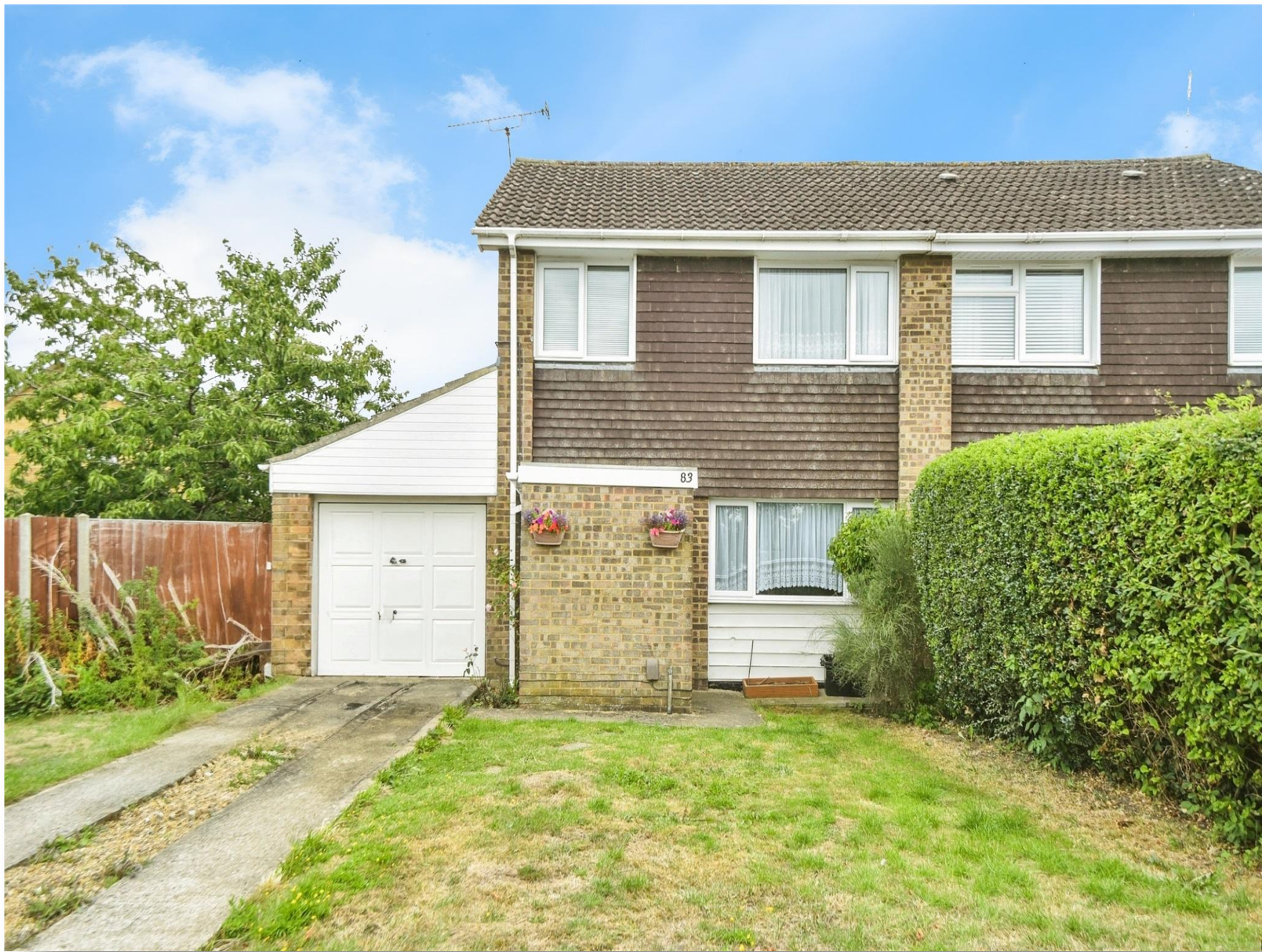
Thorne Road, Swindon SN3 6DU