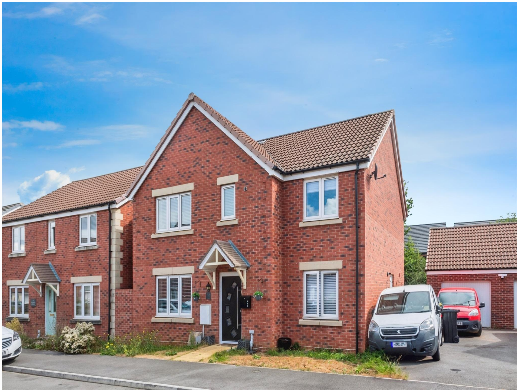
Polesdon Avenue, Coate Swindon SN3 6AE