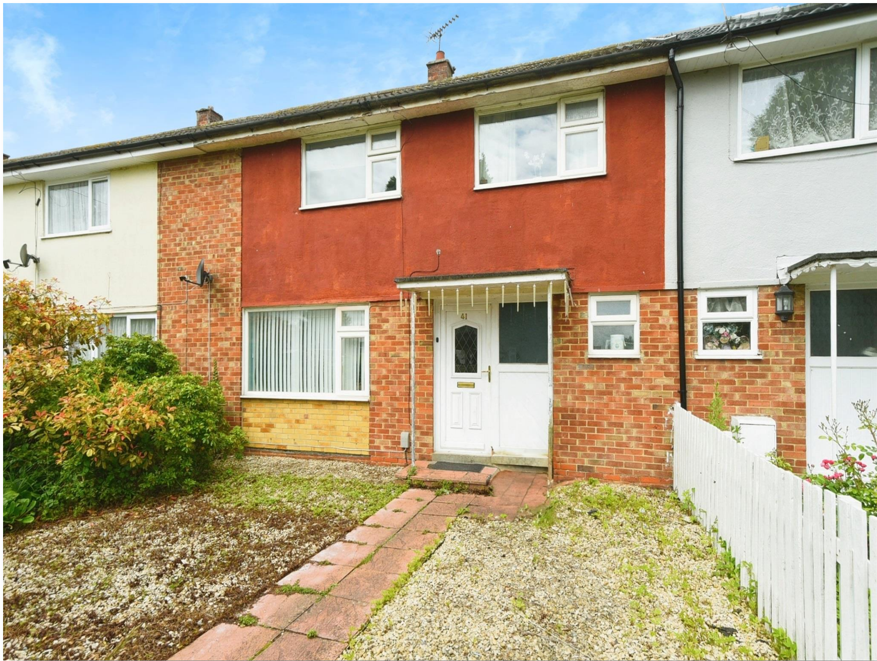
Axbridge Close, SWINDON SN3 2NB