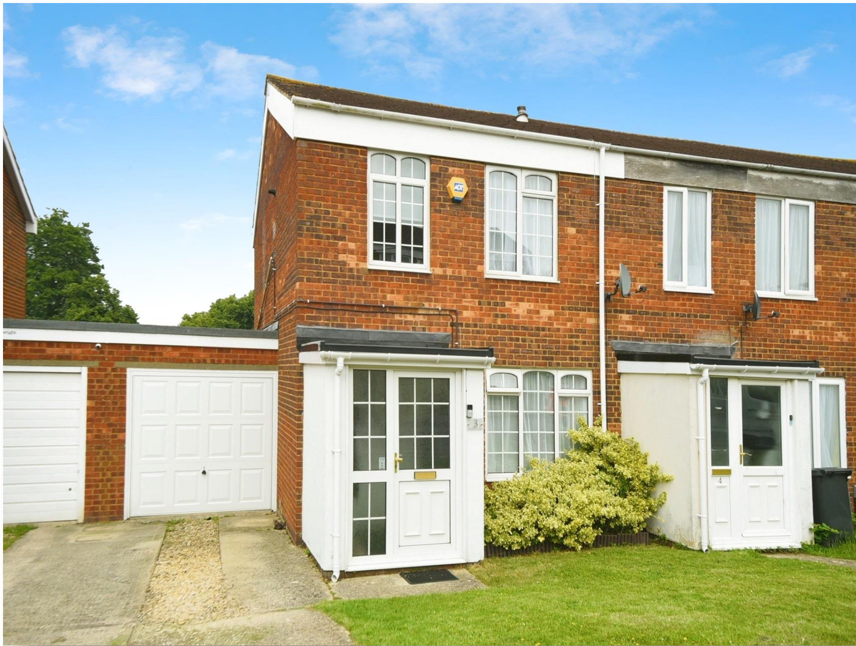
Wainwright Close, Swindon SN3 6JU