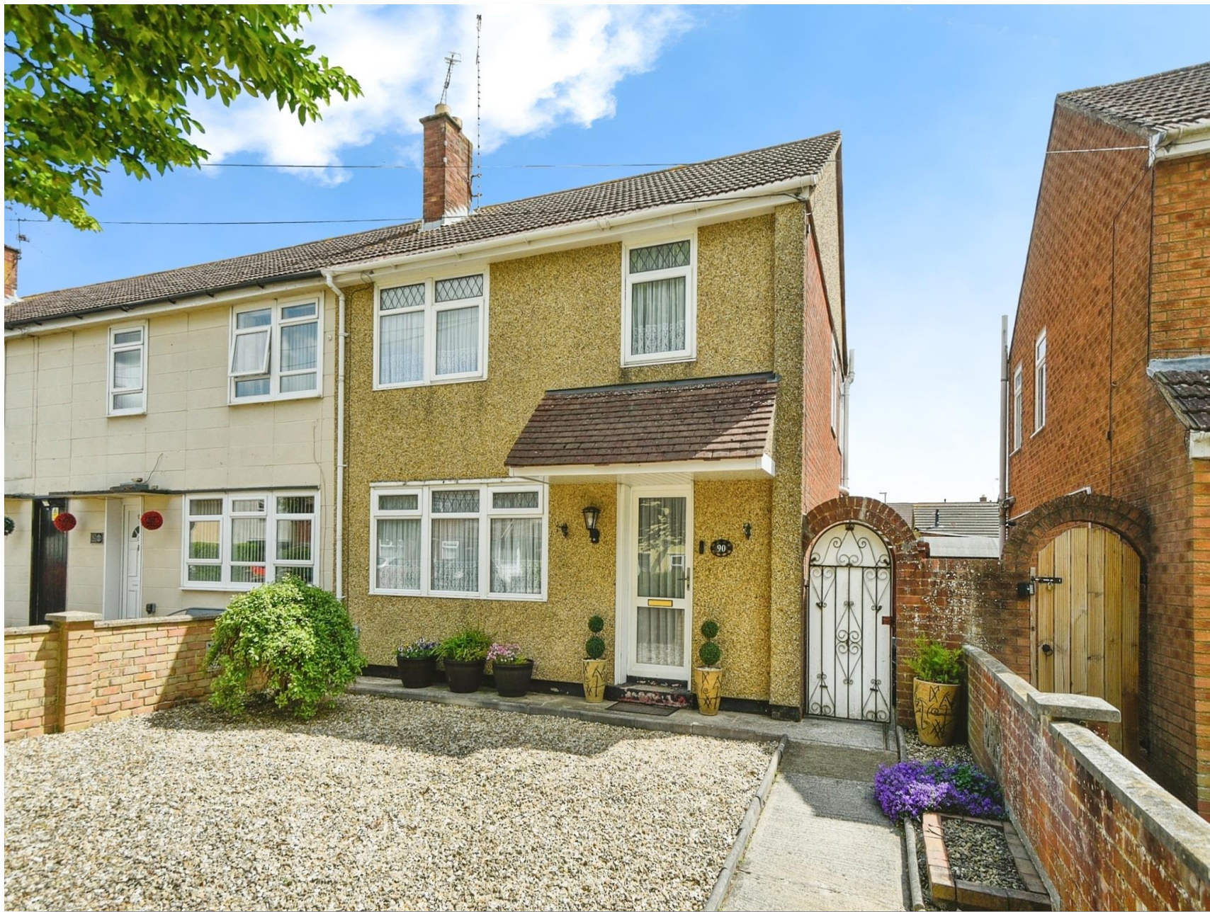
Frobisher Drive, Swindon SN3 3BZ