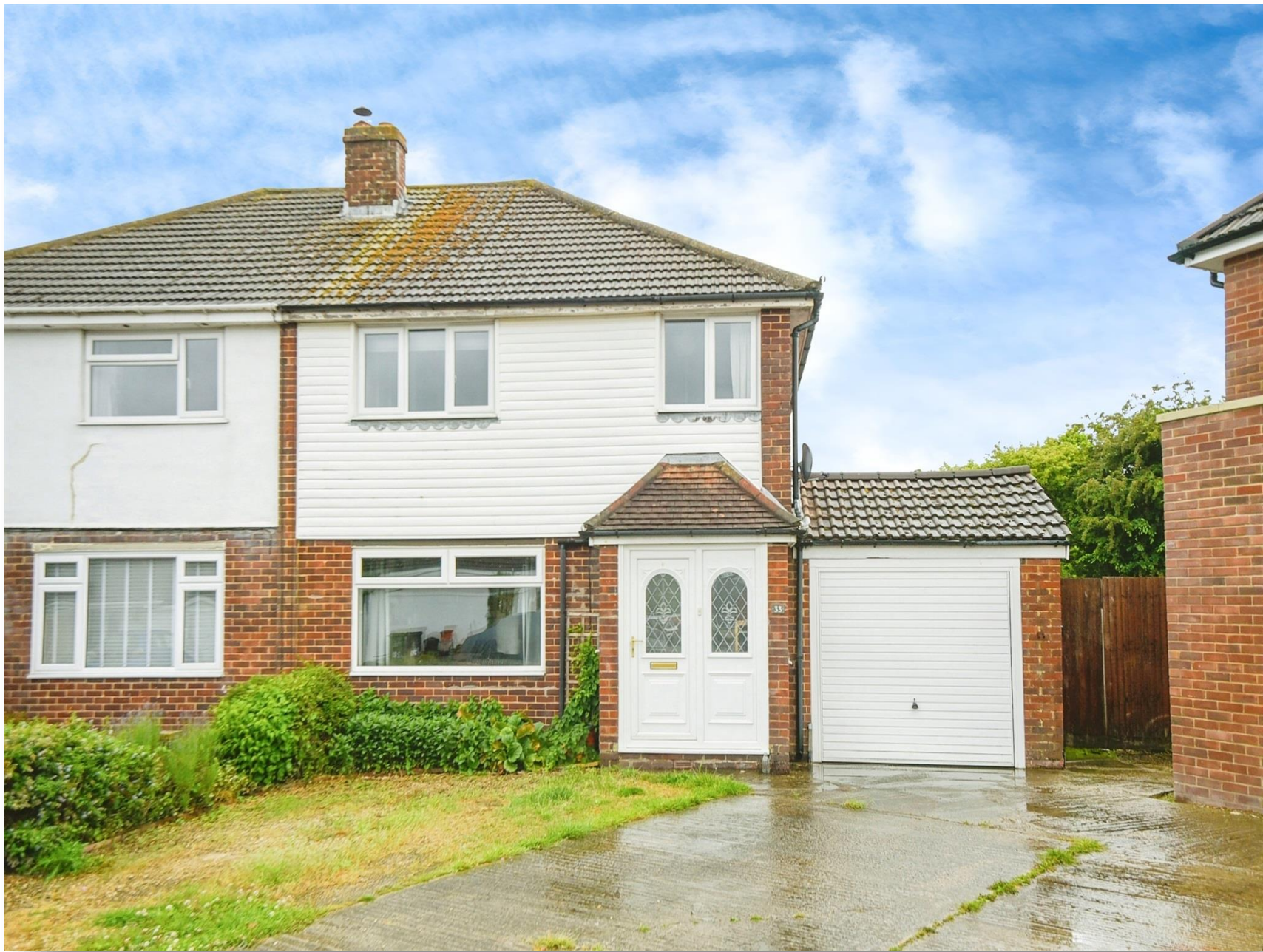
Blake Crescent, SWINDON SN3 4LR