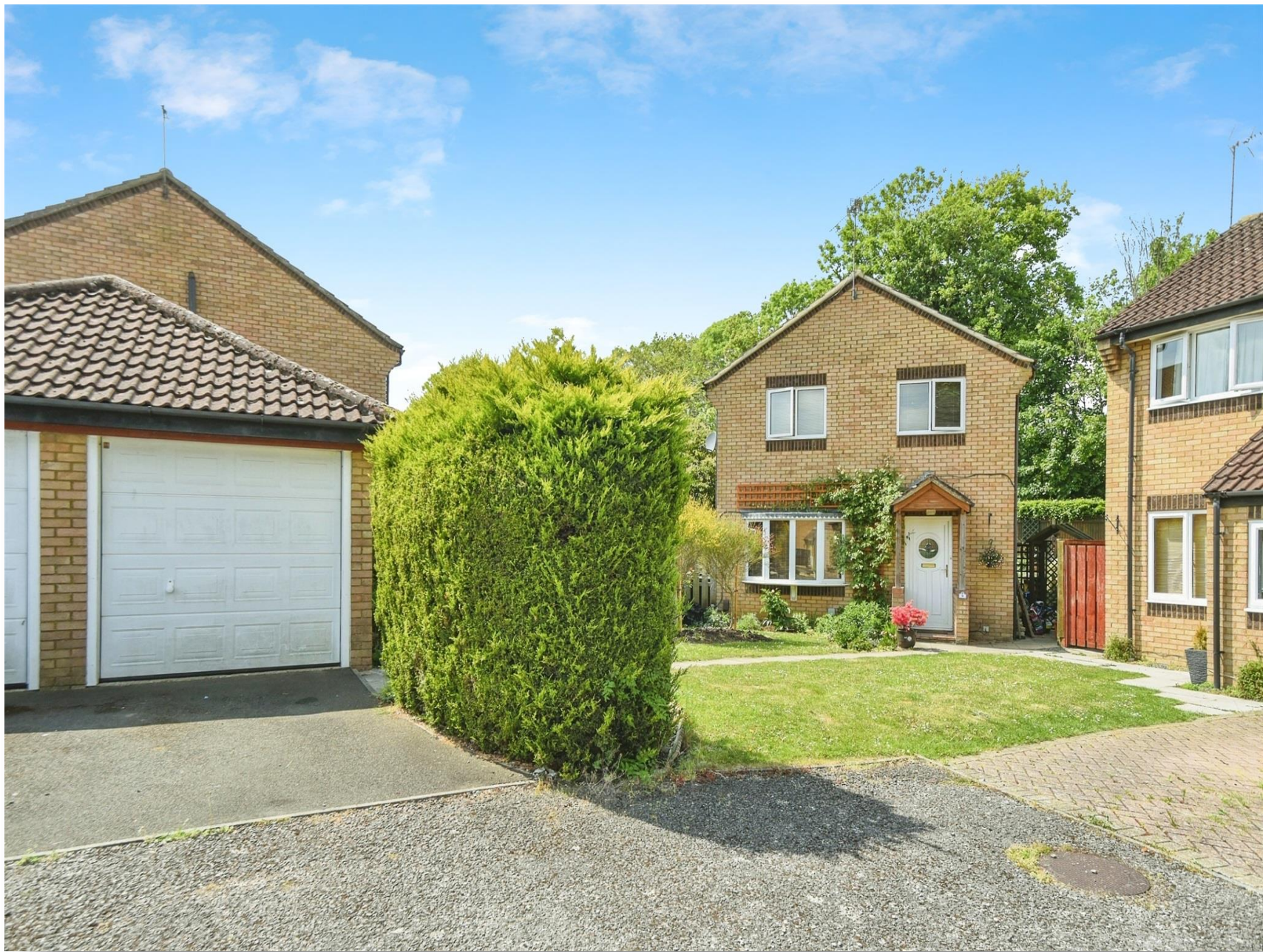
Boundary Close, Swindon SN2 7TF