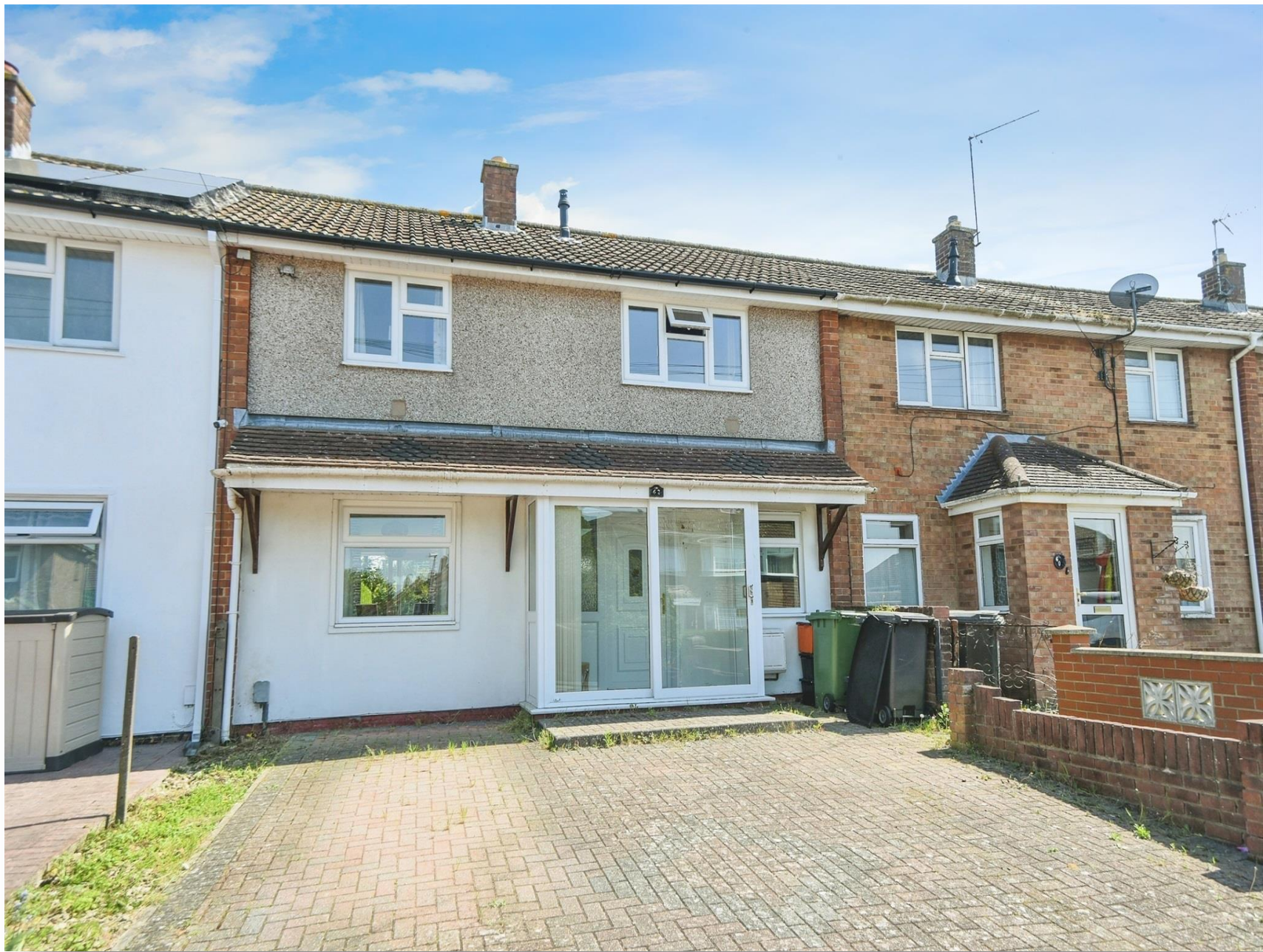
Fairford Crescent, Swindon SN25 3AA