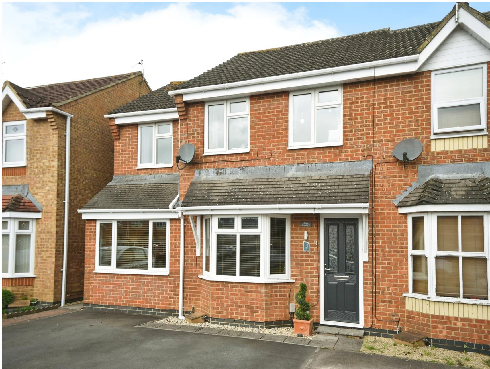
Loveridge Close, SWINDON SN2 7UD