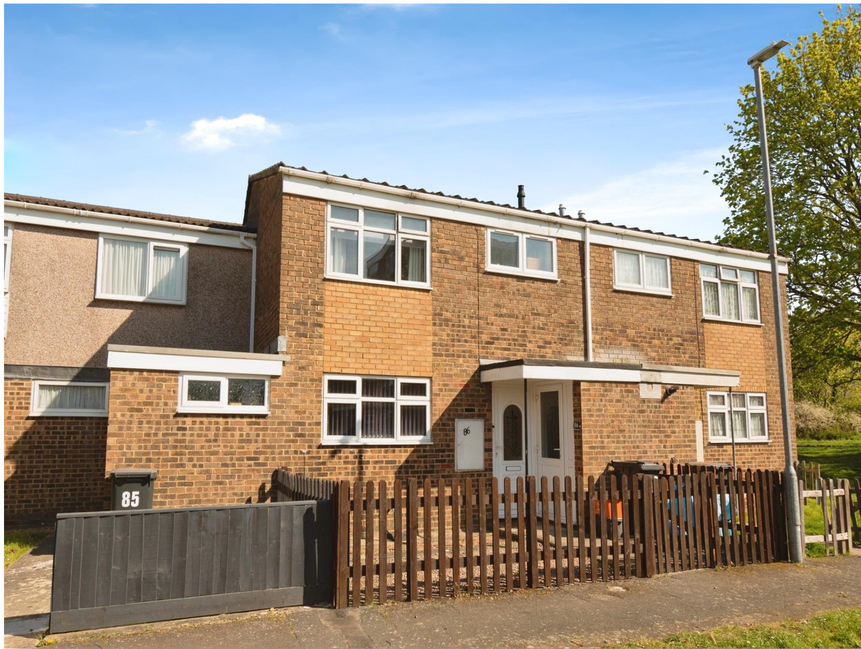
Bowleymead, Swindon SN3 3TE