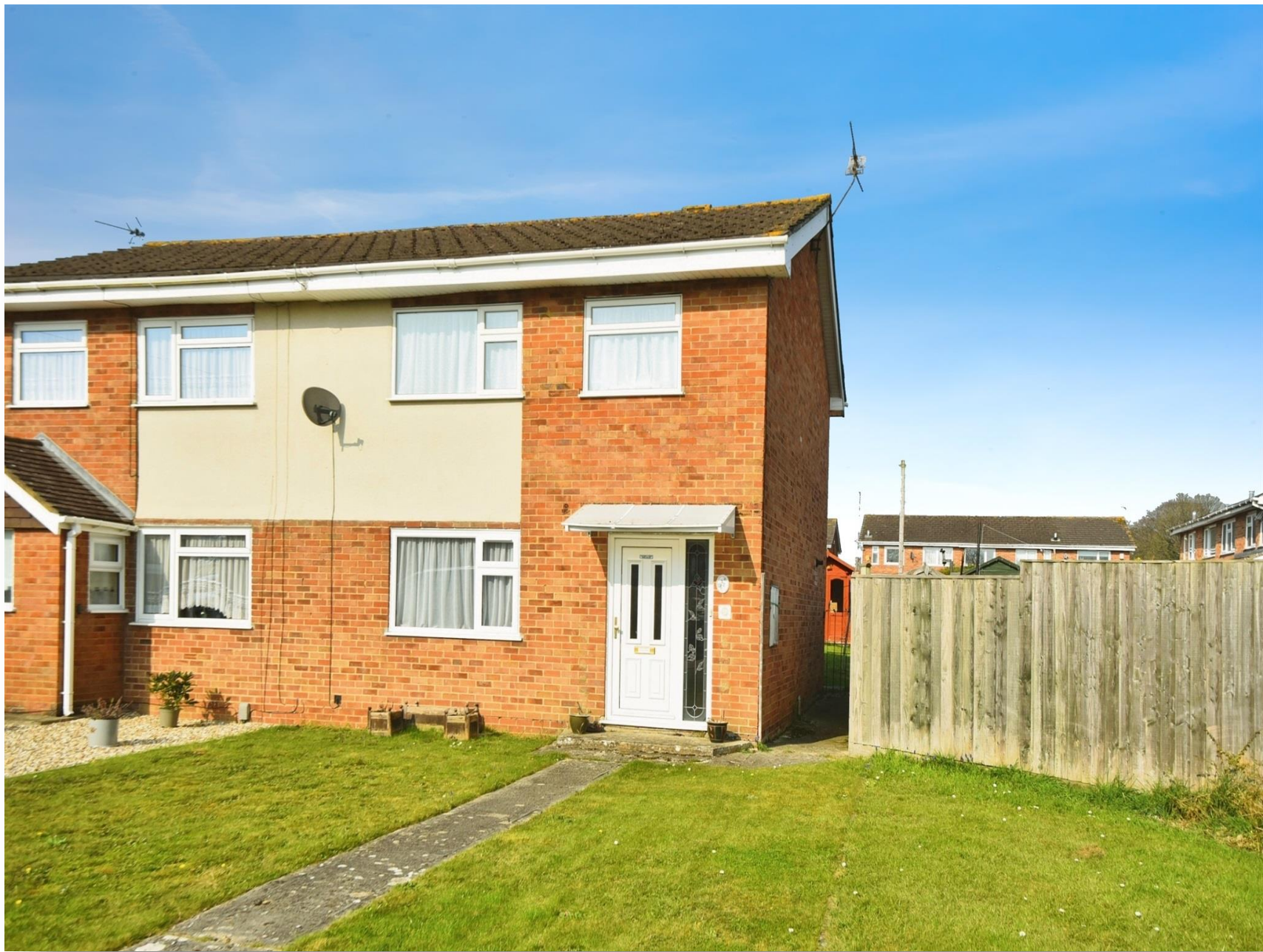
Hathaway Road, Swindon SN2 7TP