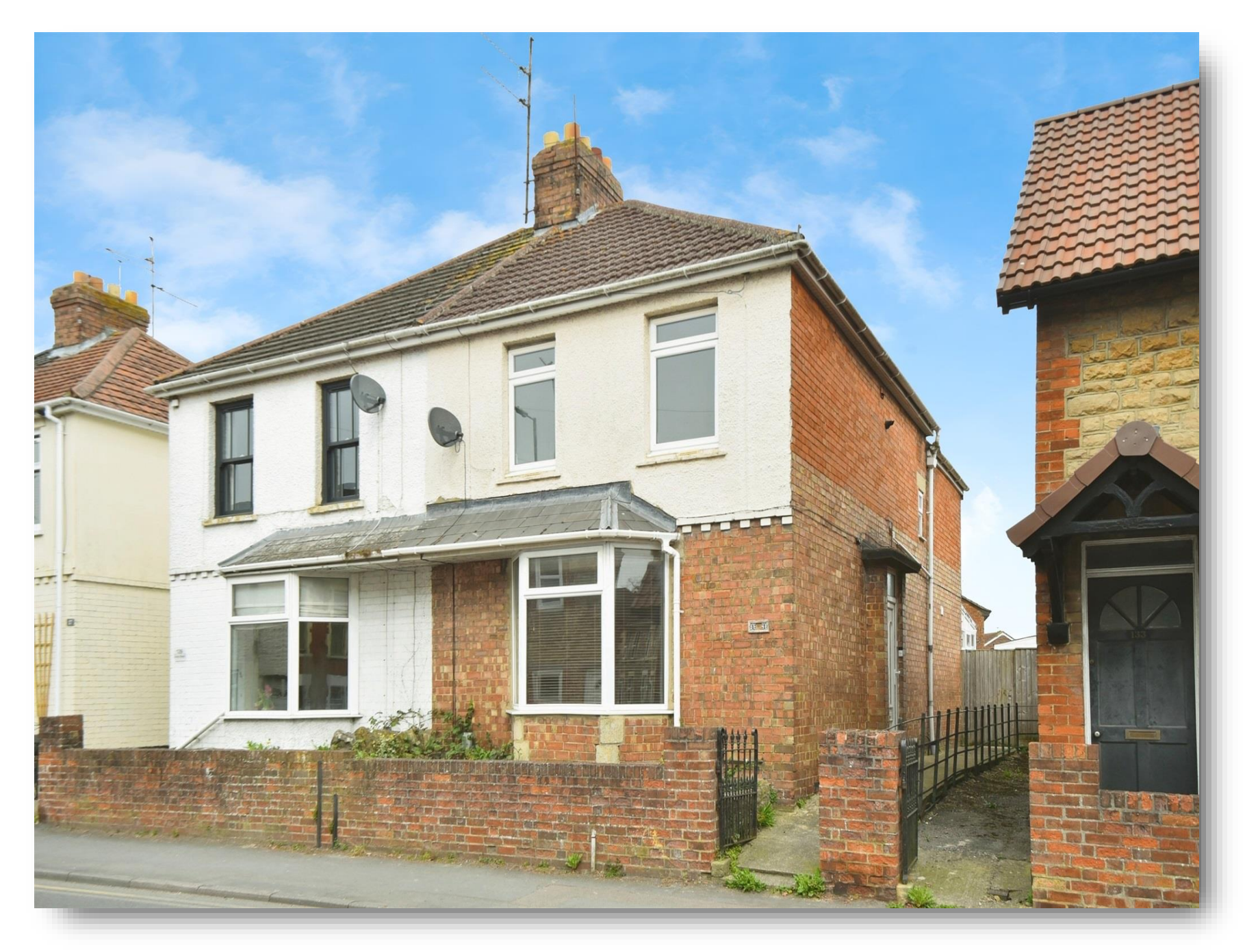
Ermin Street, Swindon SN3 4NH