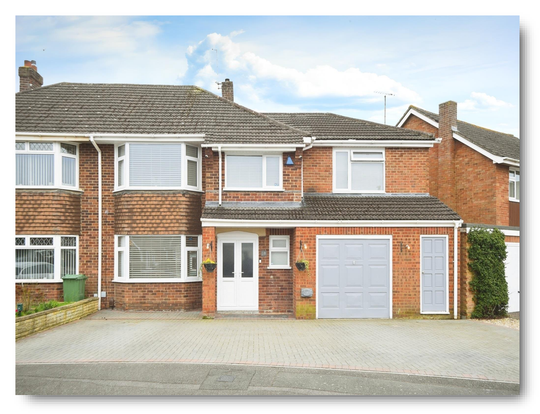
Crawley Avenue, Swindon SN3 4LB