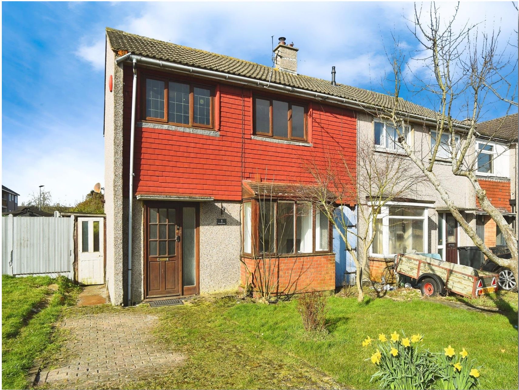
Belvedere Road, Swindon SN3 2DQ