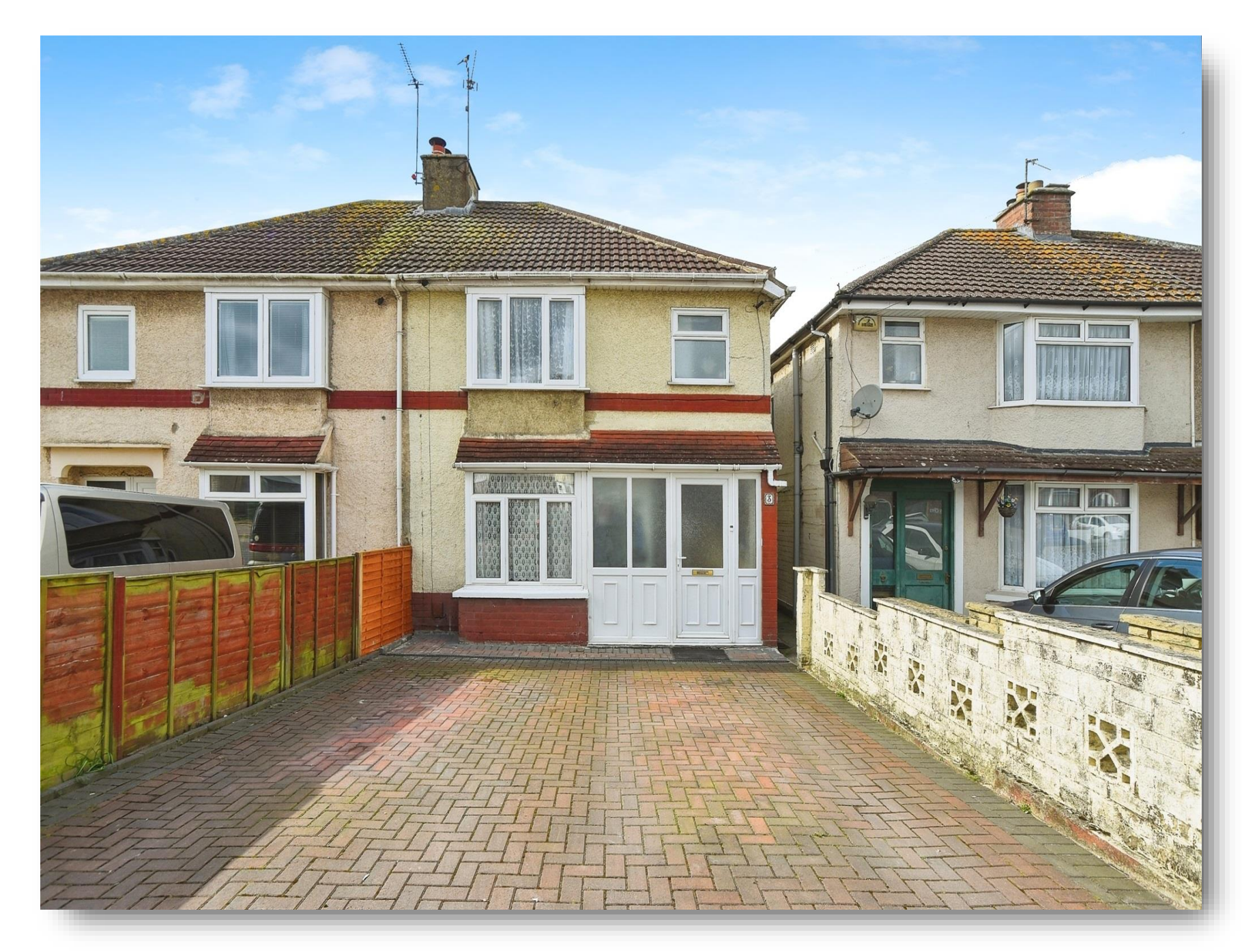
Elgin Drive, Swindon SN2 8DN