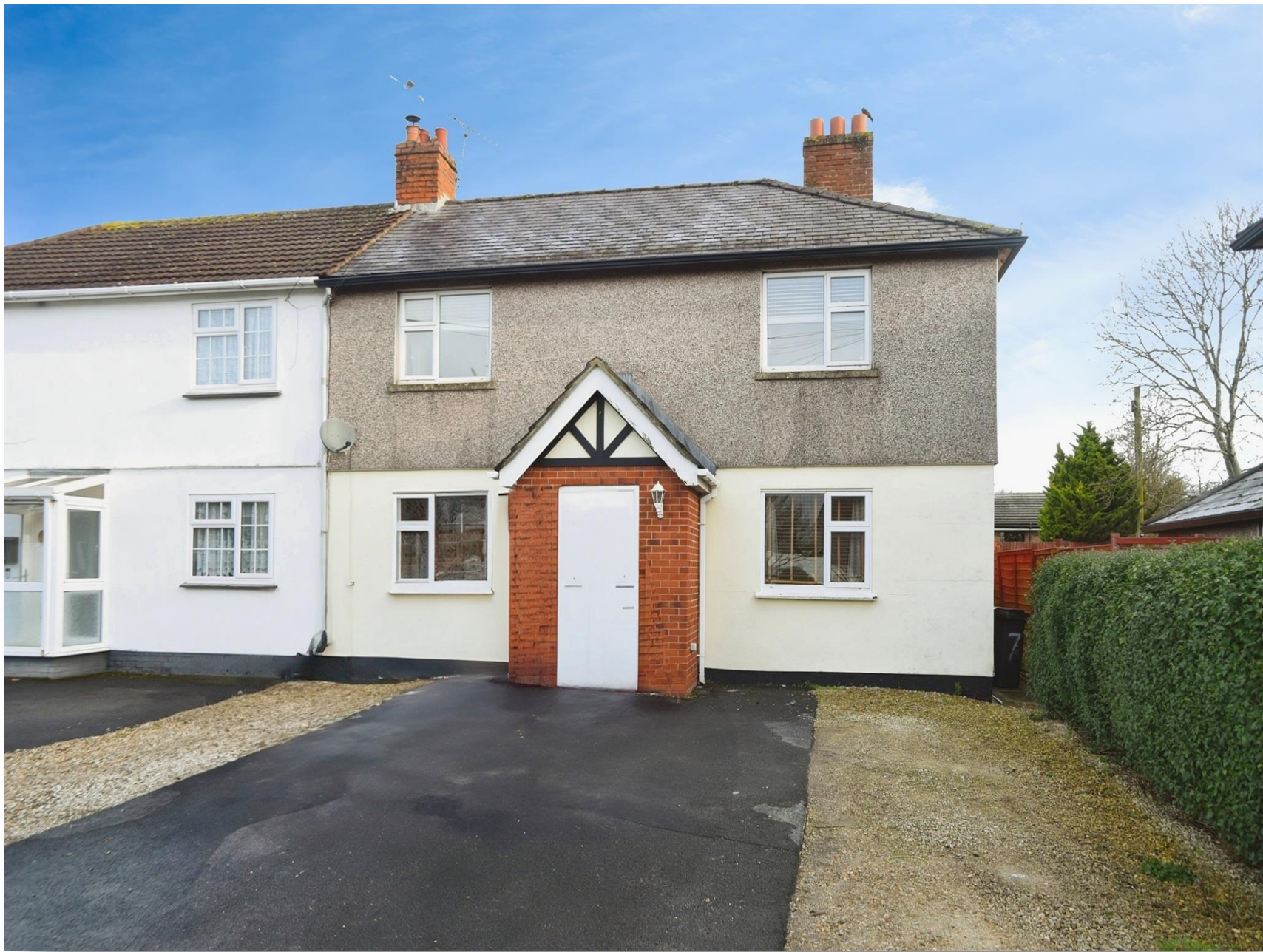
Ermin Street, Swindon SN3 4RH