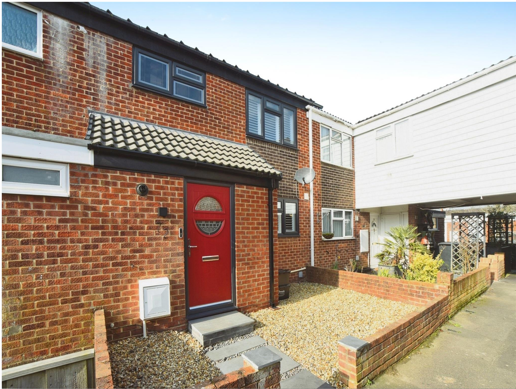
Colingsmead, SWINDON SN3 3TQ