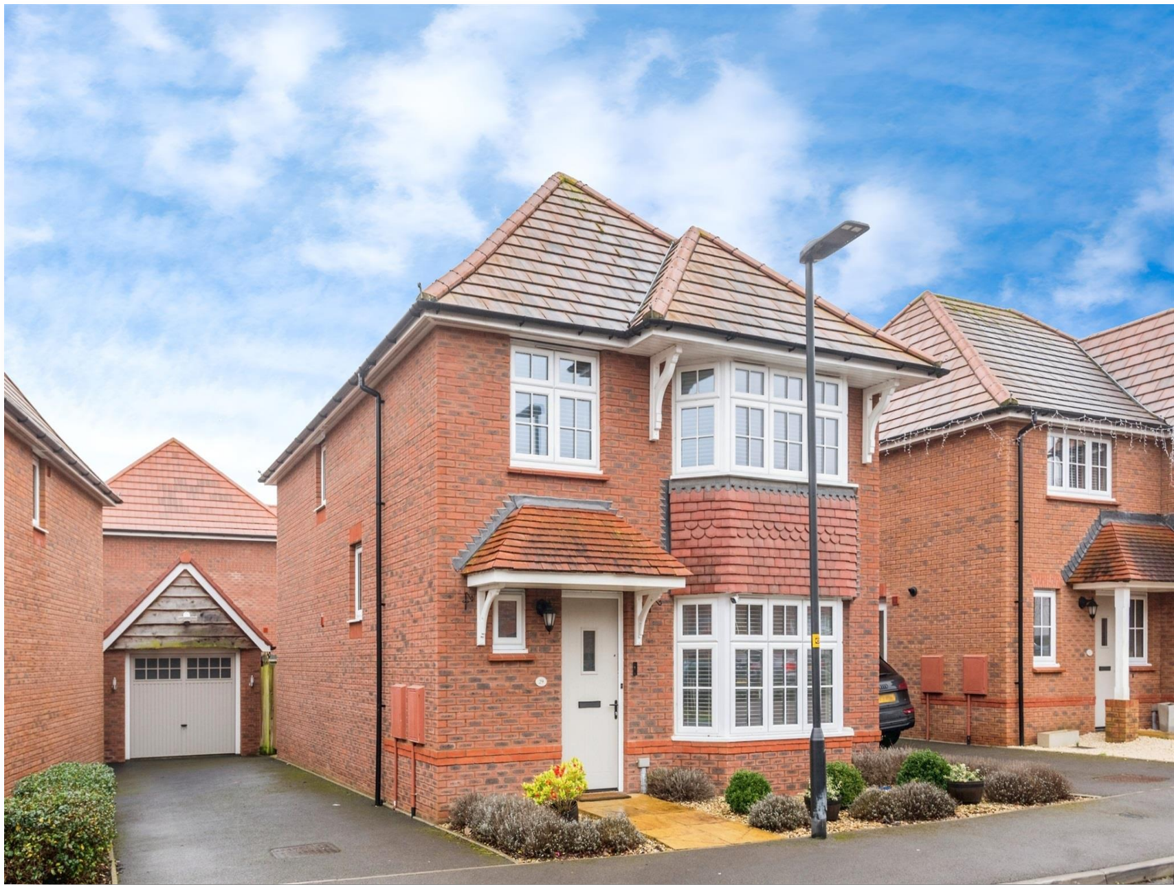
Berryfield, Coate Swindon SN3 6FB