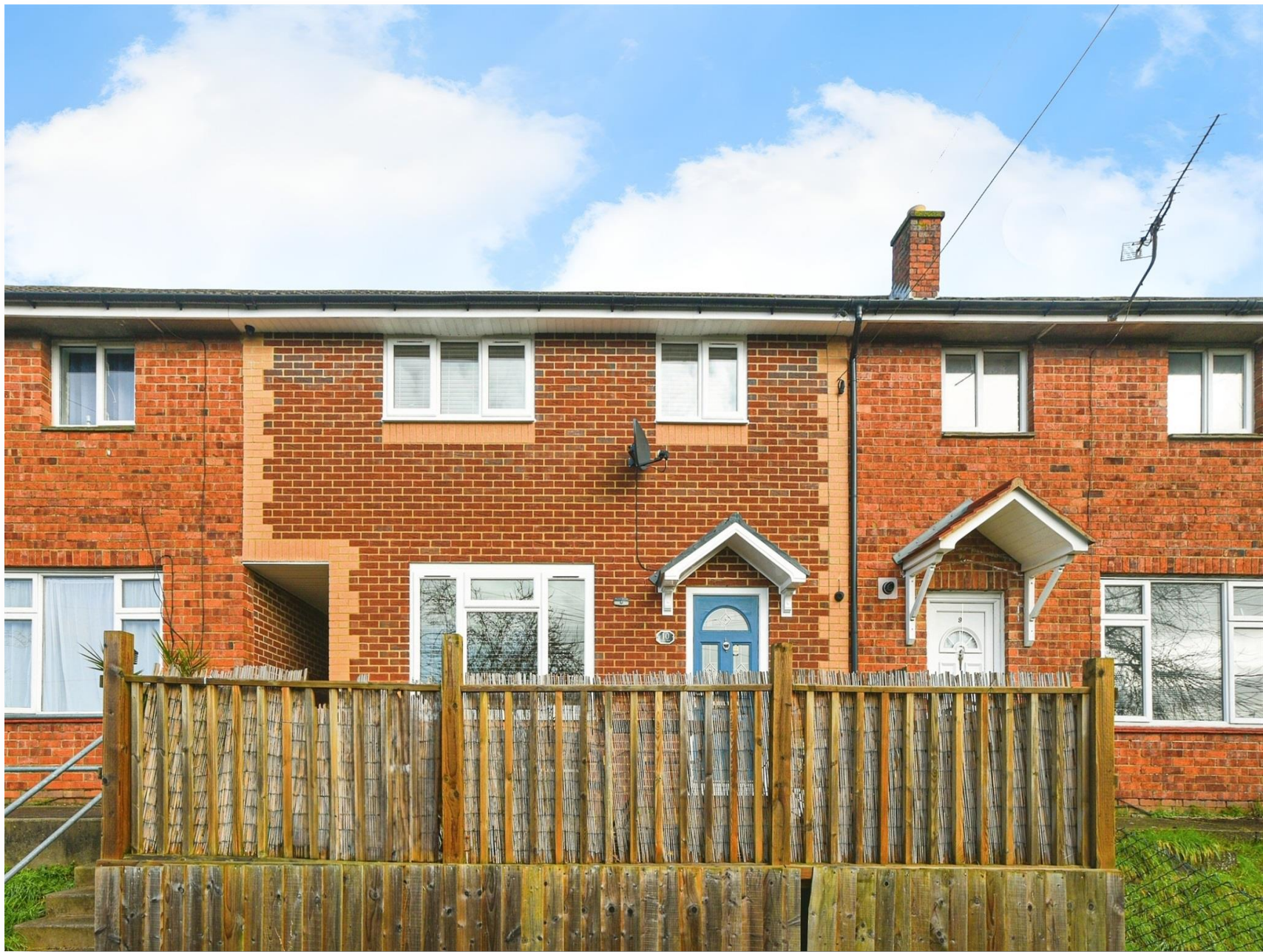
Semley Walk, Swindon SN2 5DH