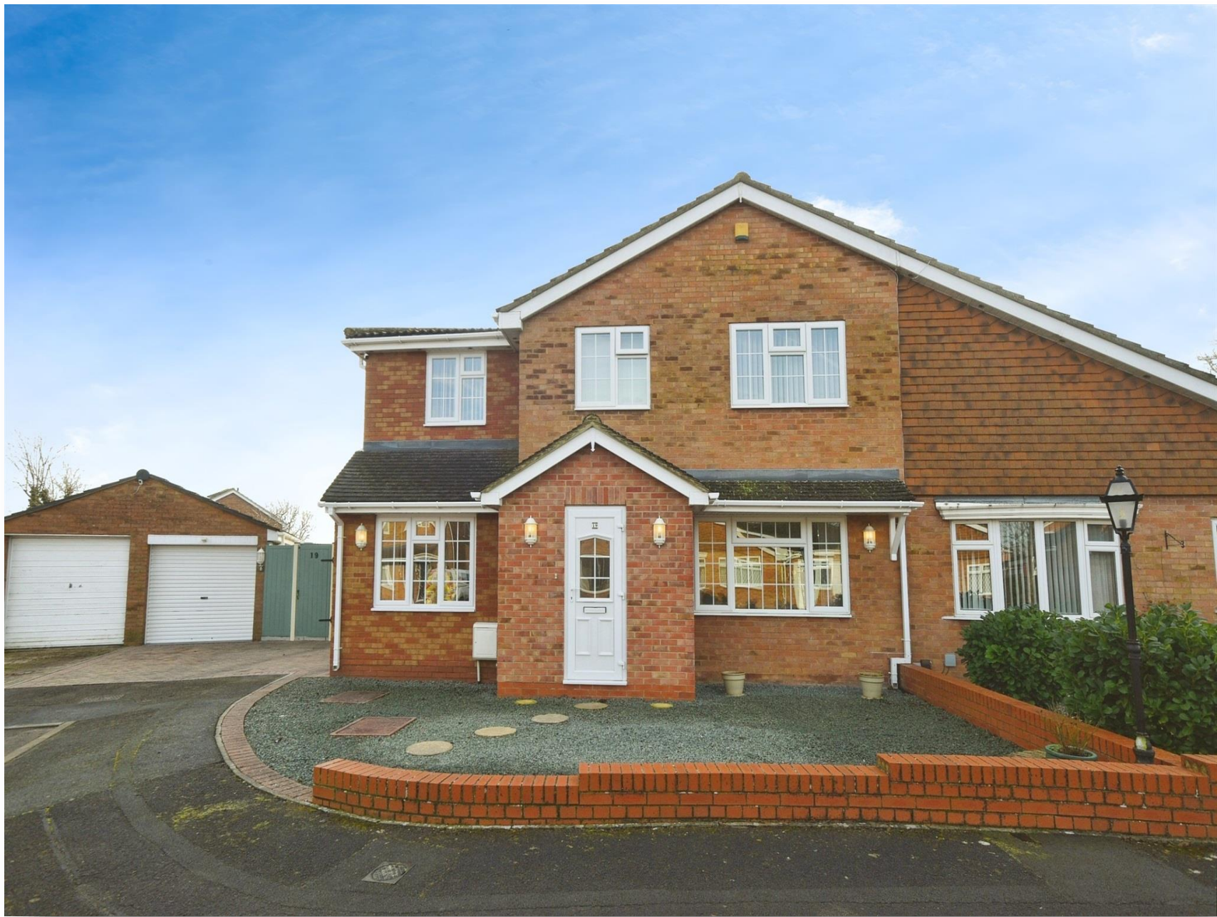
Taylor Crescent, Swindon SN3 4UX