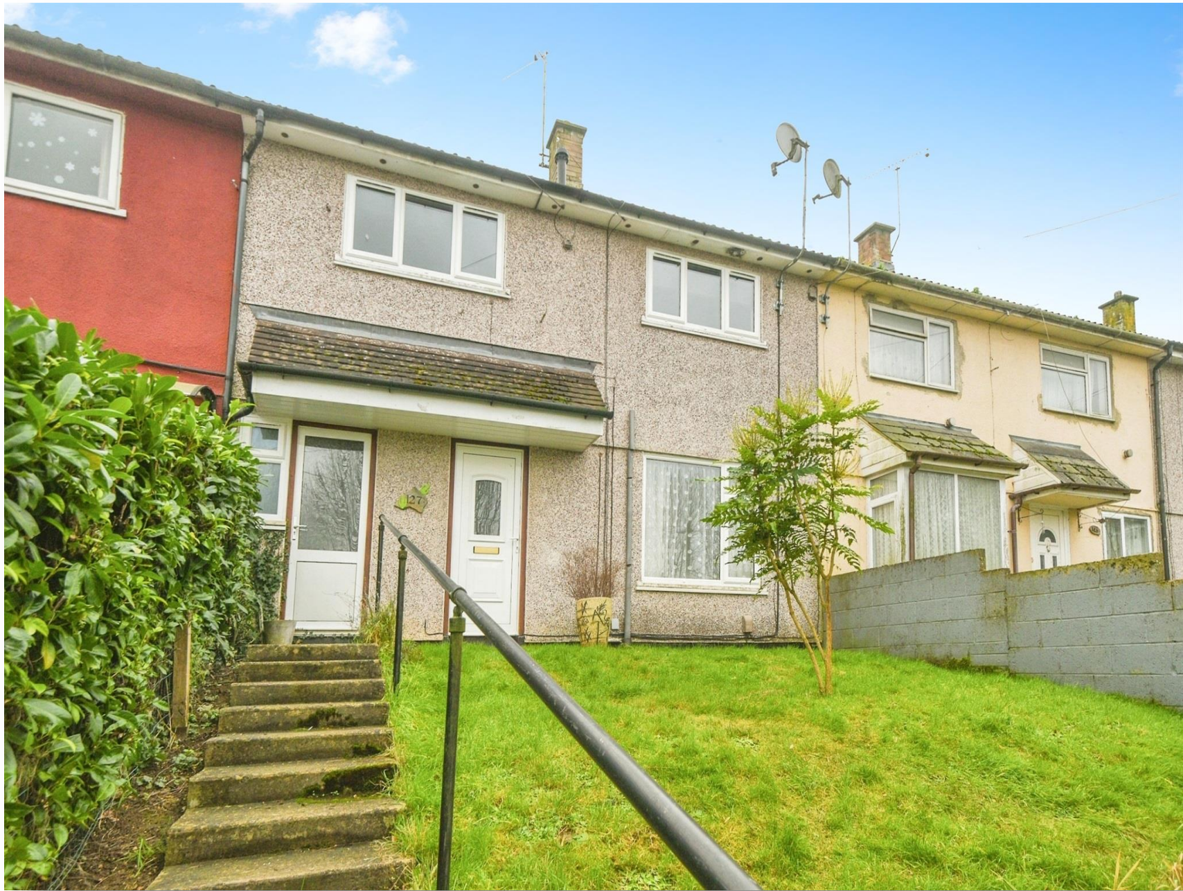
Ramsbury Avenue, Swindon SN2 5PG