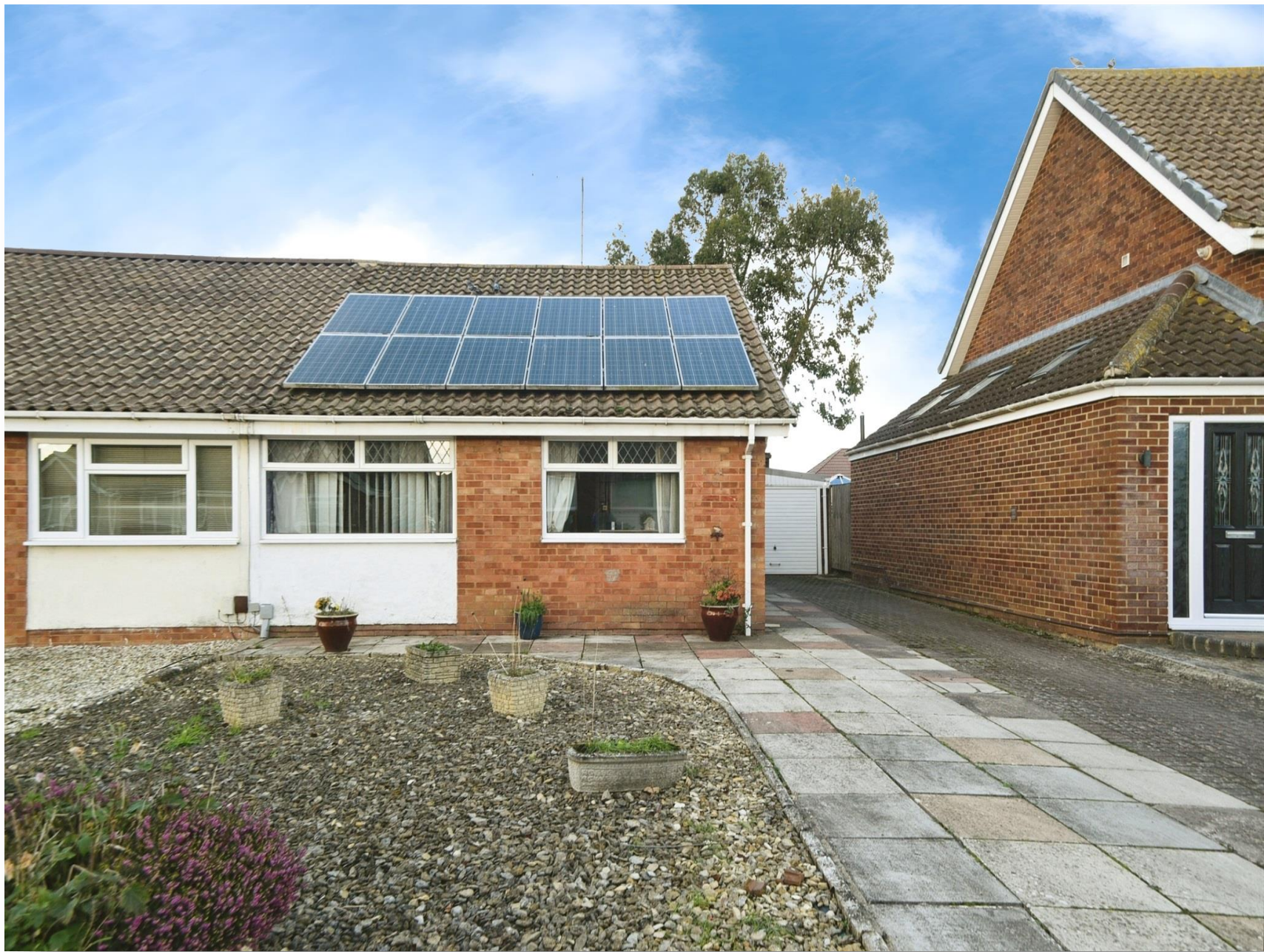
Trajan Road, Swindon SN3 4BW