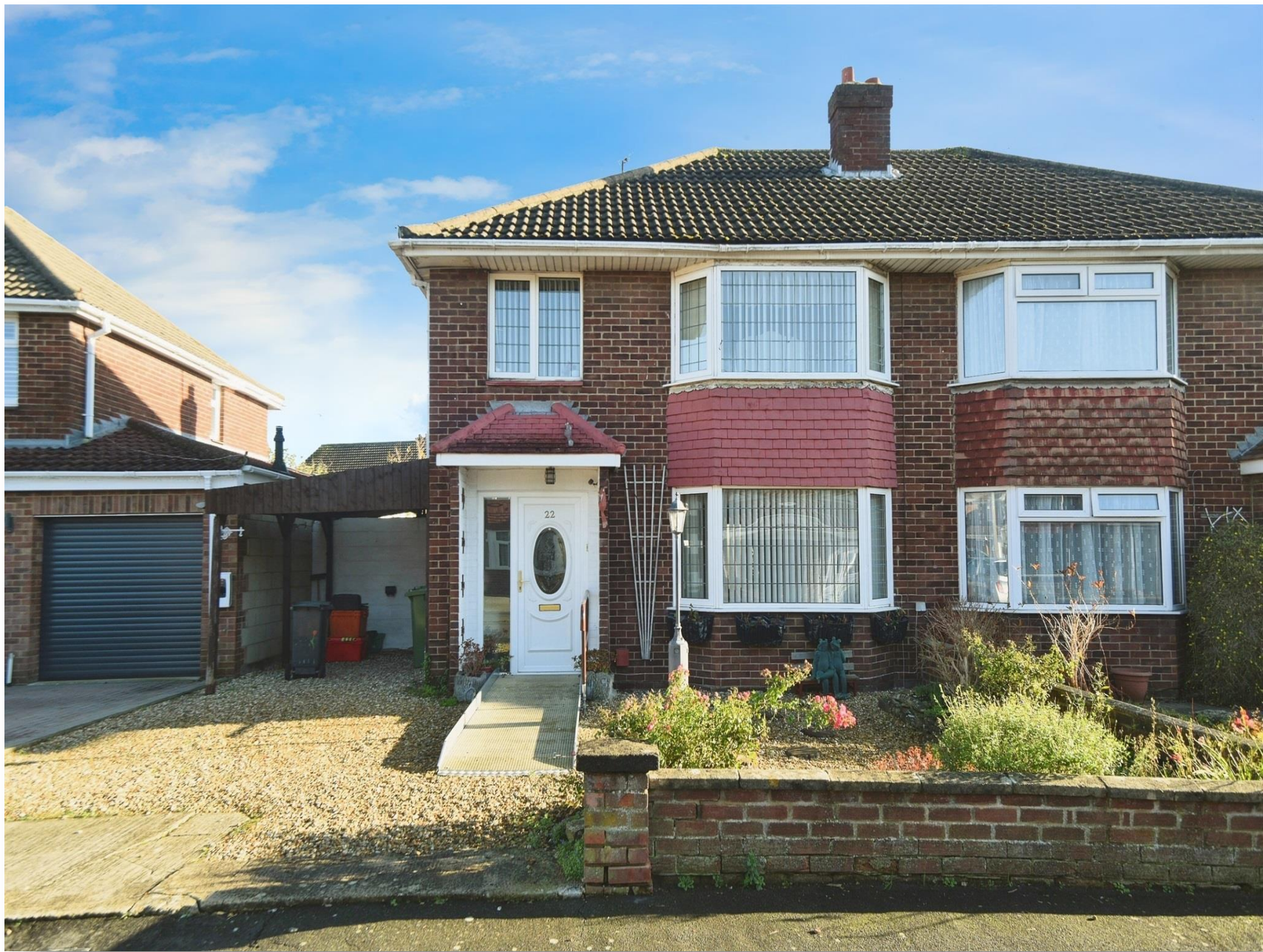
Bucklebury Close, Swindon SN3 4JH