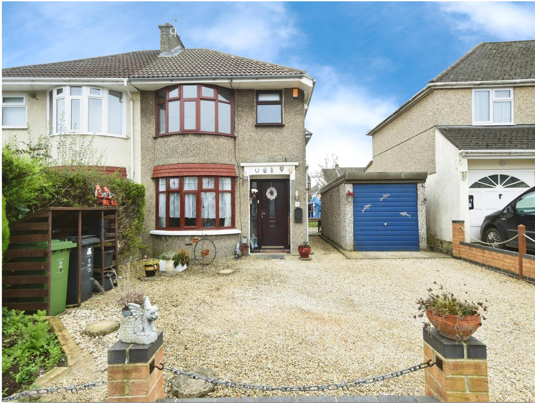
Orchard Grove, Swindon SN2 7QR