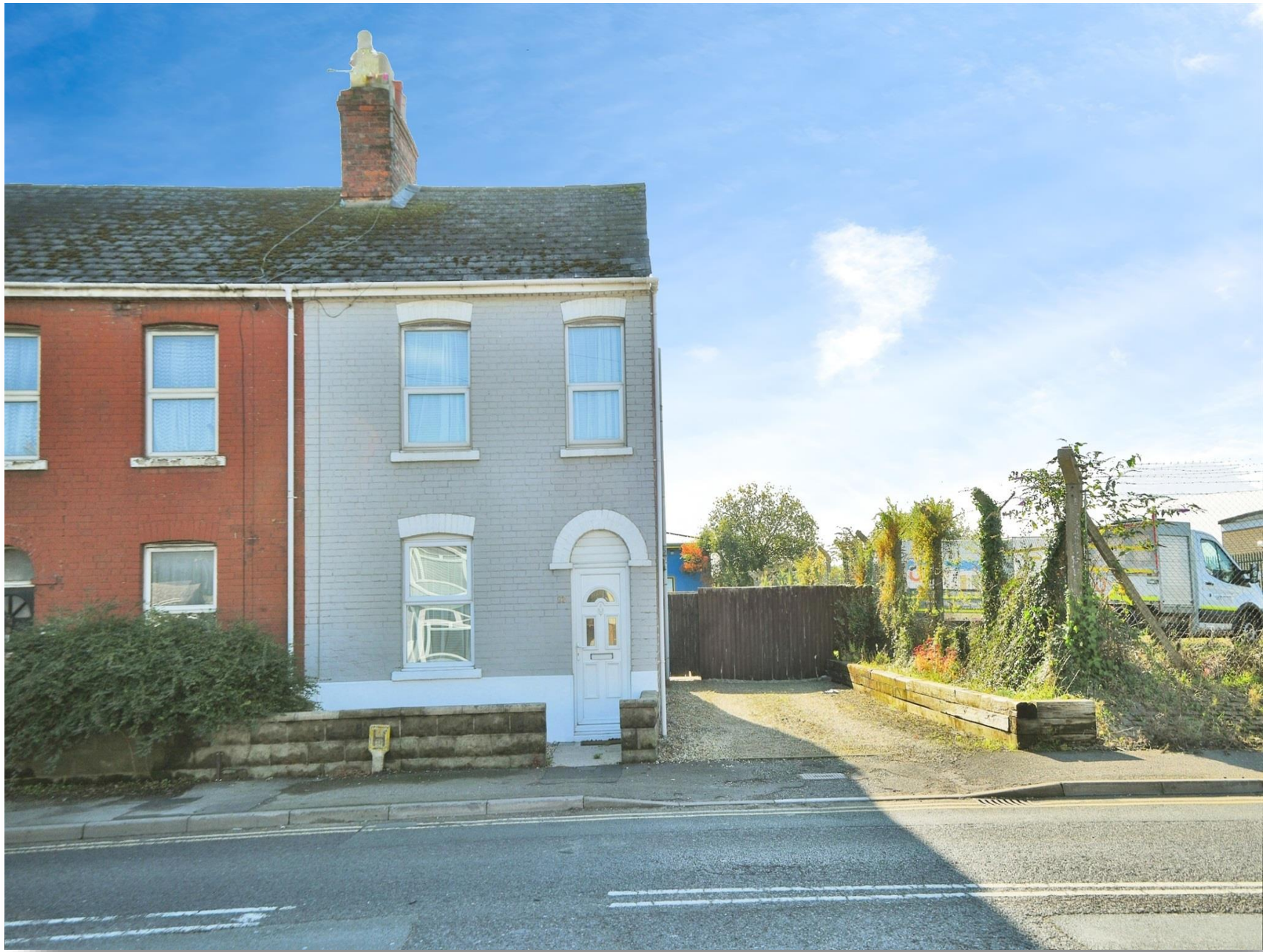
Gypsy Lane, Swindon SN2 8DH