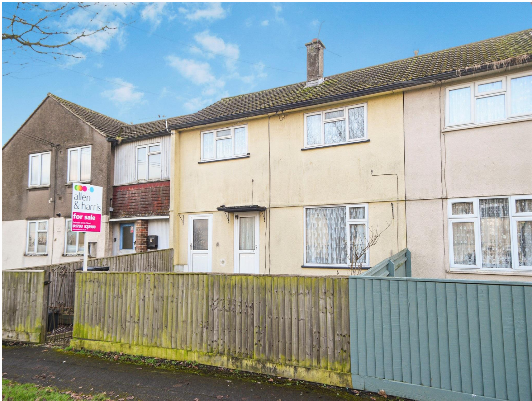
Oakford Walk, Swindon SN3 2RE