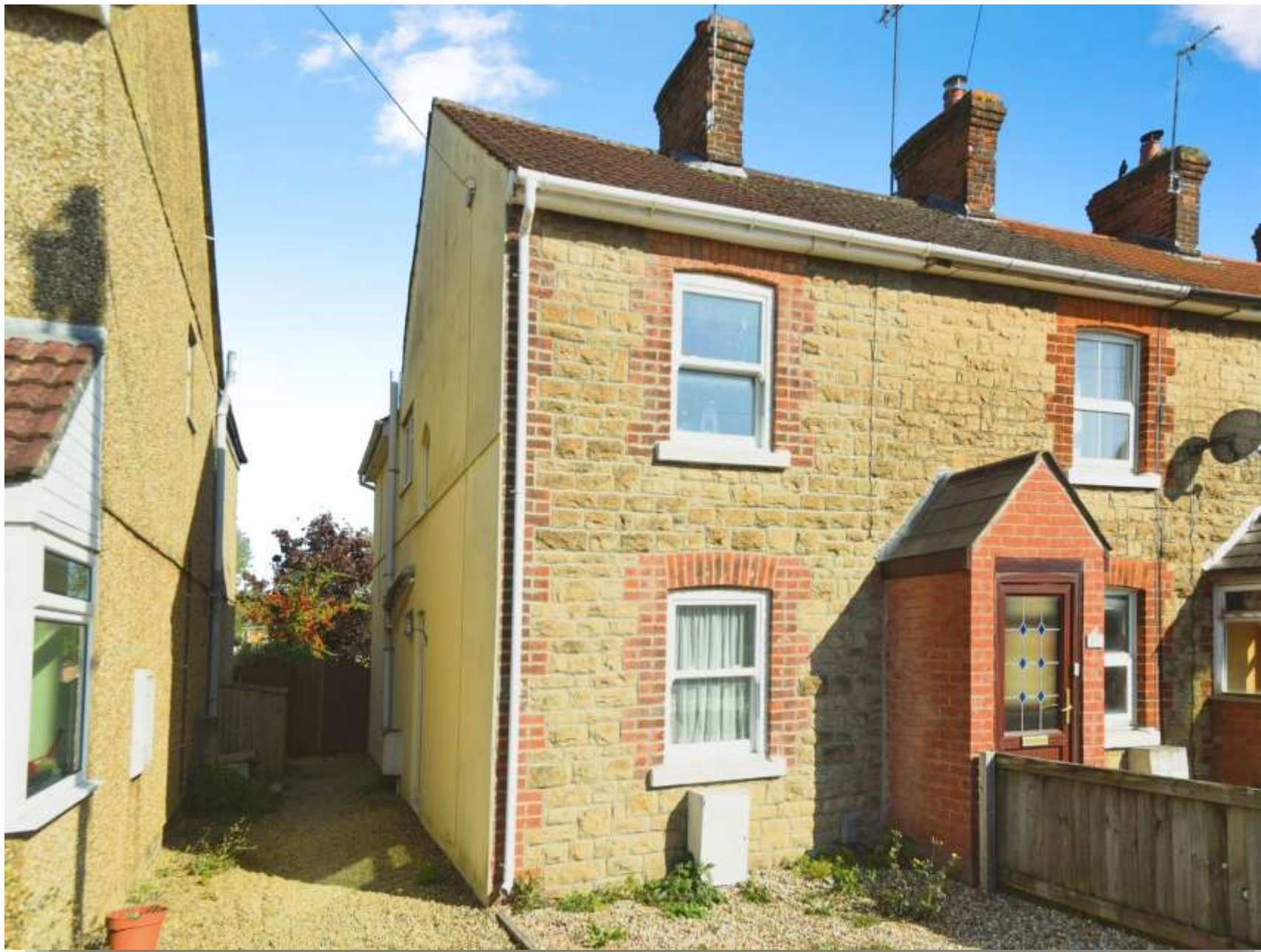
Hyde Road, Swindon SN2 7SB