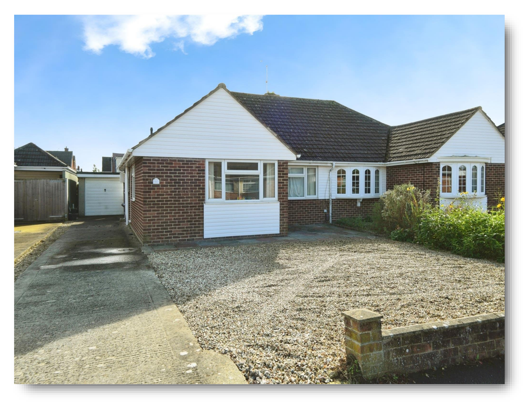
Waverley Road, Swindon SN3 4AX