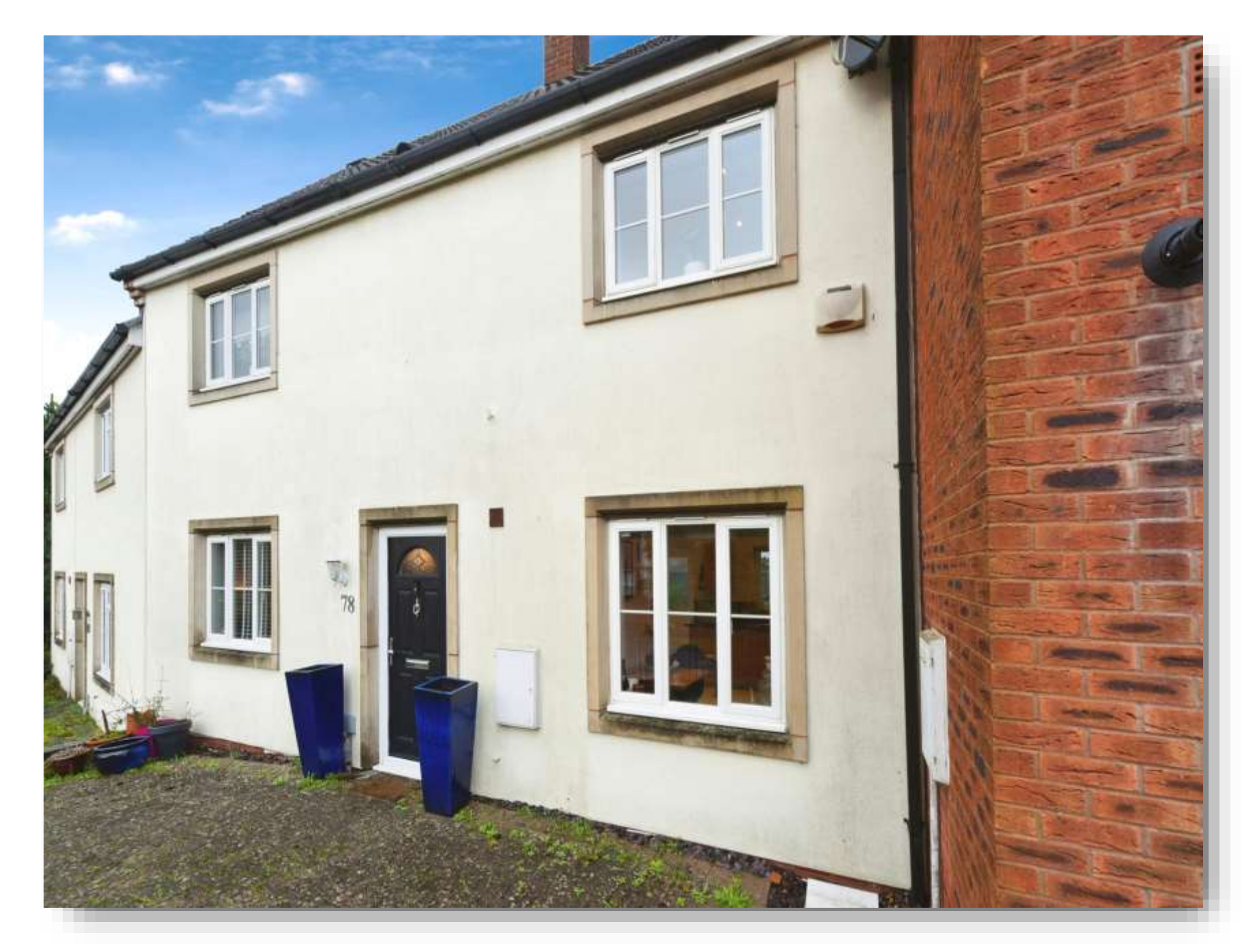
Thresher Drive, Swindon SN25 4AG