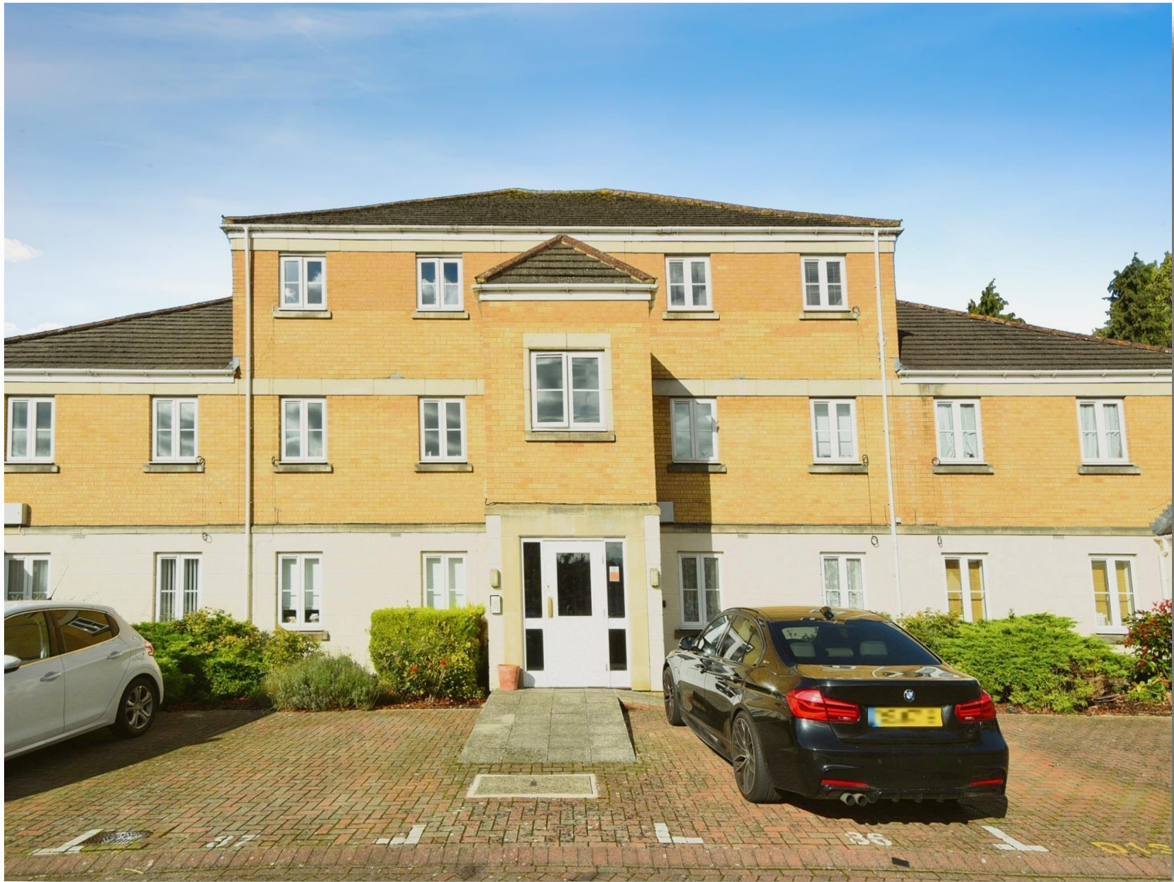
Winton Road, Swindon SN3 4XL