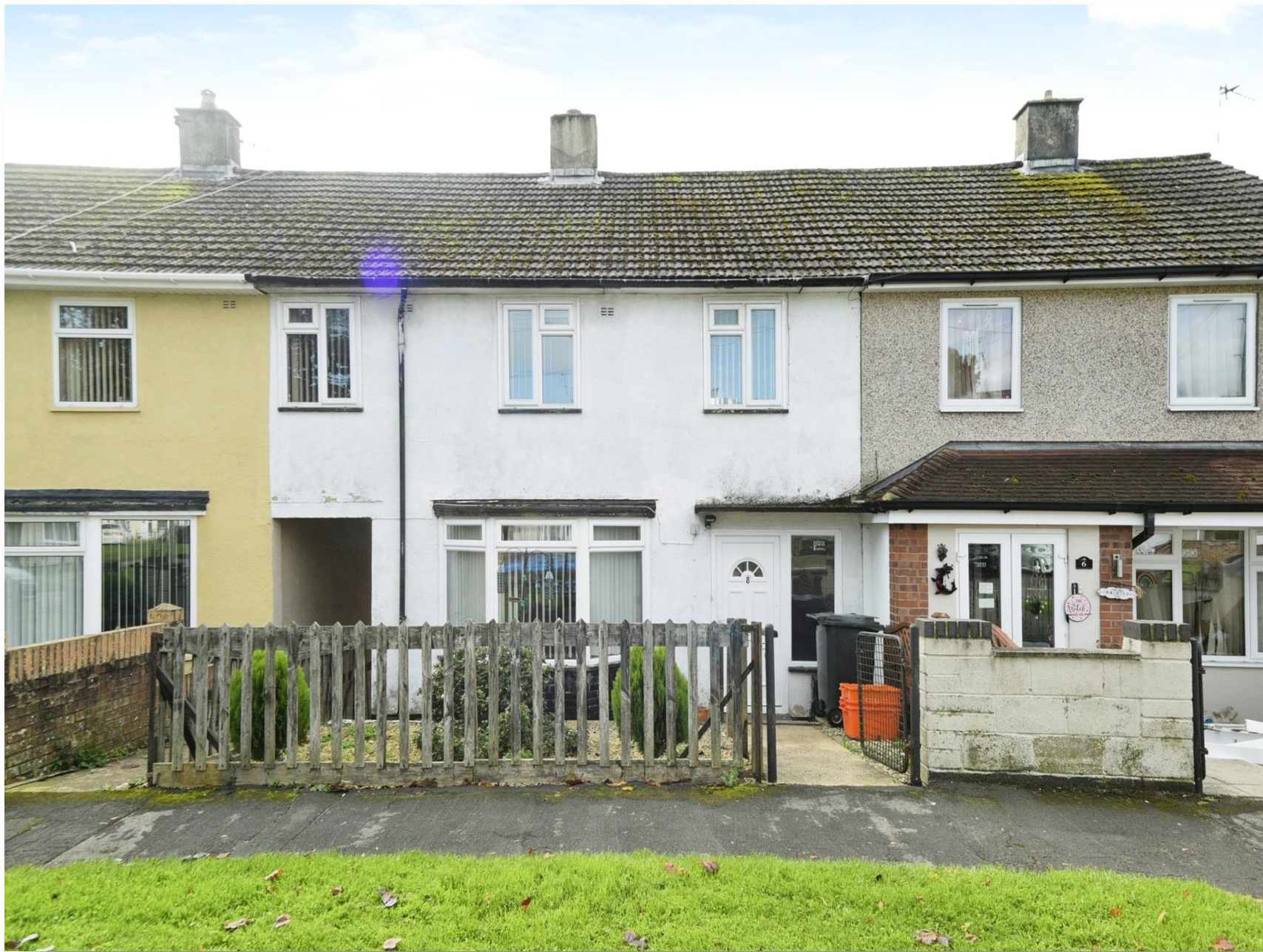
Marston Avenue, Swindon SN2 5EN