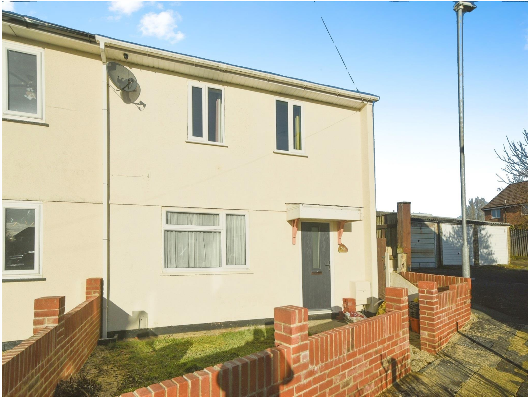
Bratton Close, SWINDON SN2 5LF