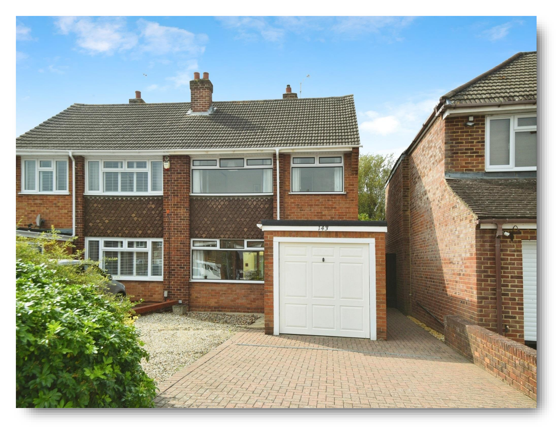
Grange Drive, Swindon SN3 4JY