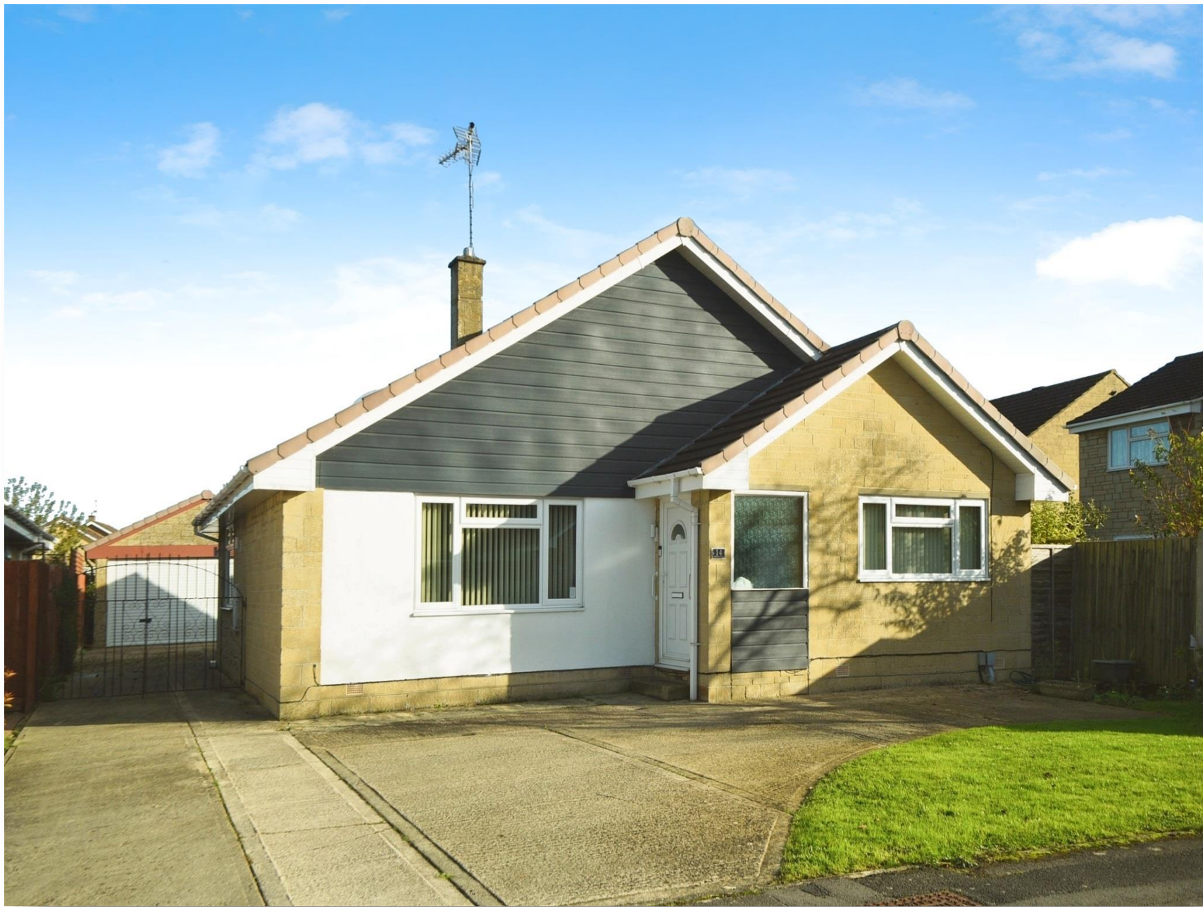
Rawston Close, Swindon SN3 3PW