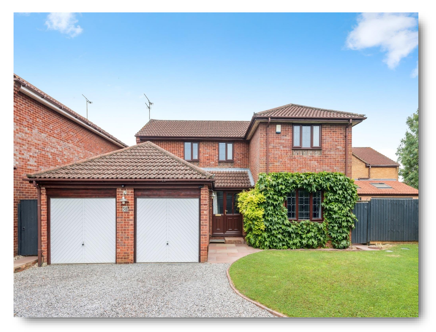
Boundary Close, Swindon SN2 7TL