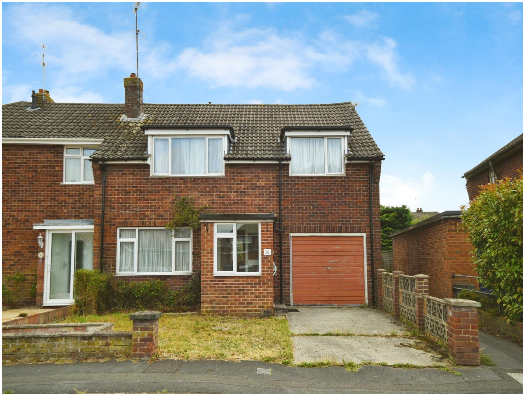
Tudor Crescent, Swindon SN3 4JU