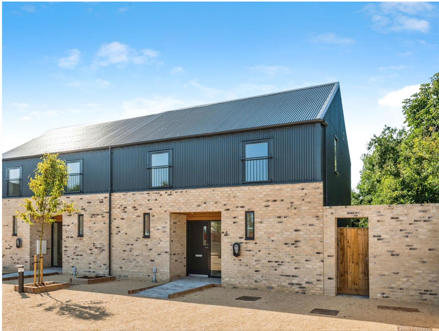
The Limes, Green Road, Stratton St Margaret, Swindon SN2 7JE