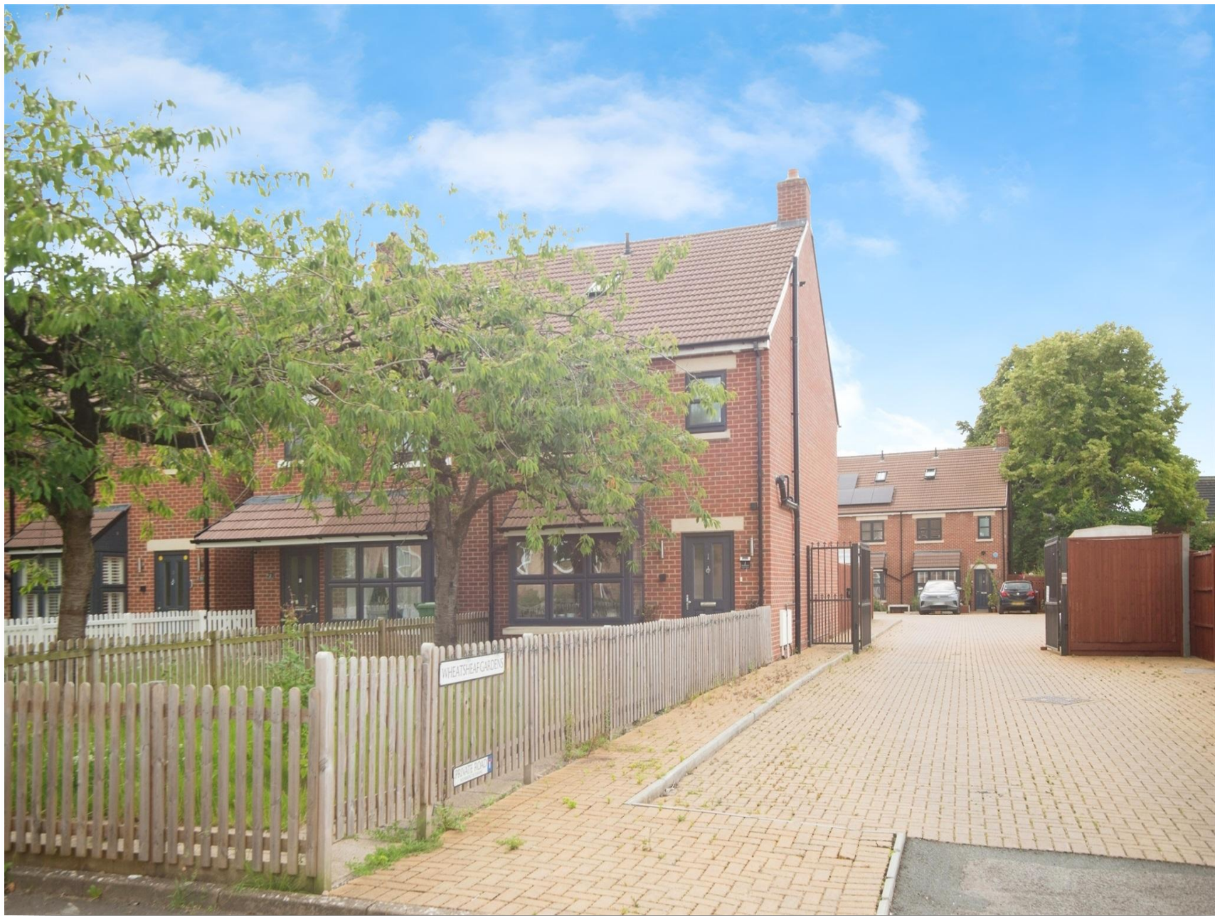
Wheatsheaf Gardens, Swindon SN2 7AT