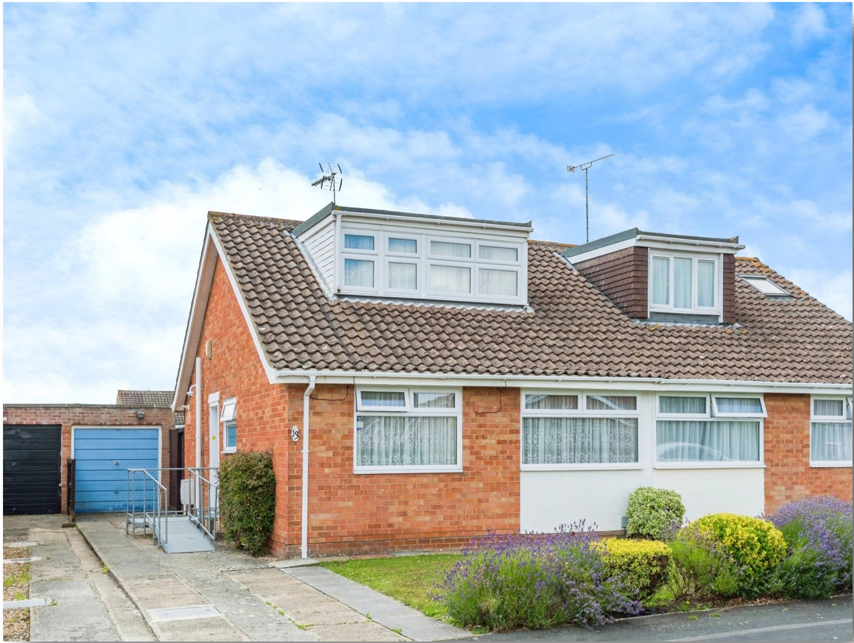
Corinium Way, Swindon, SN3 4BN