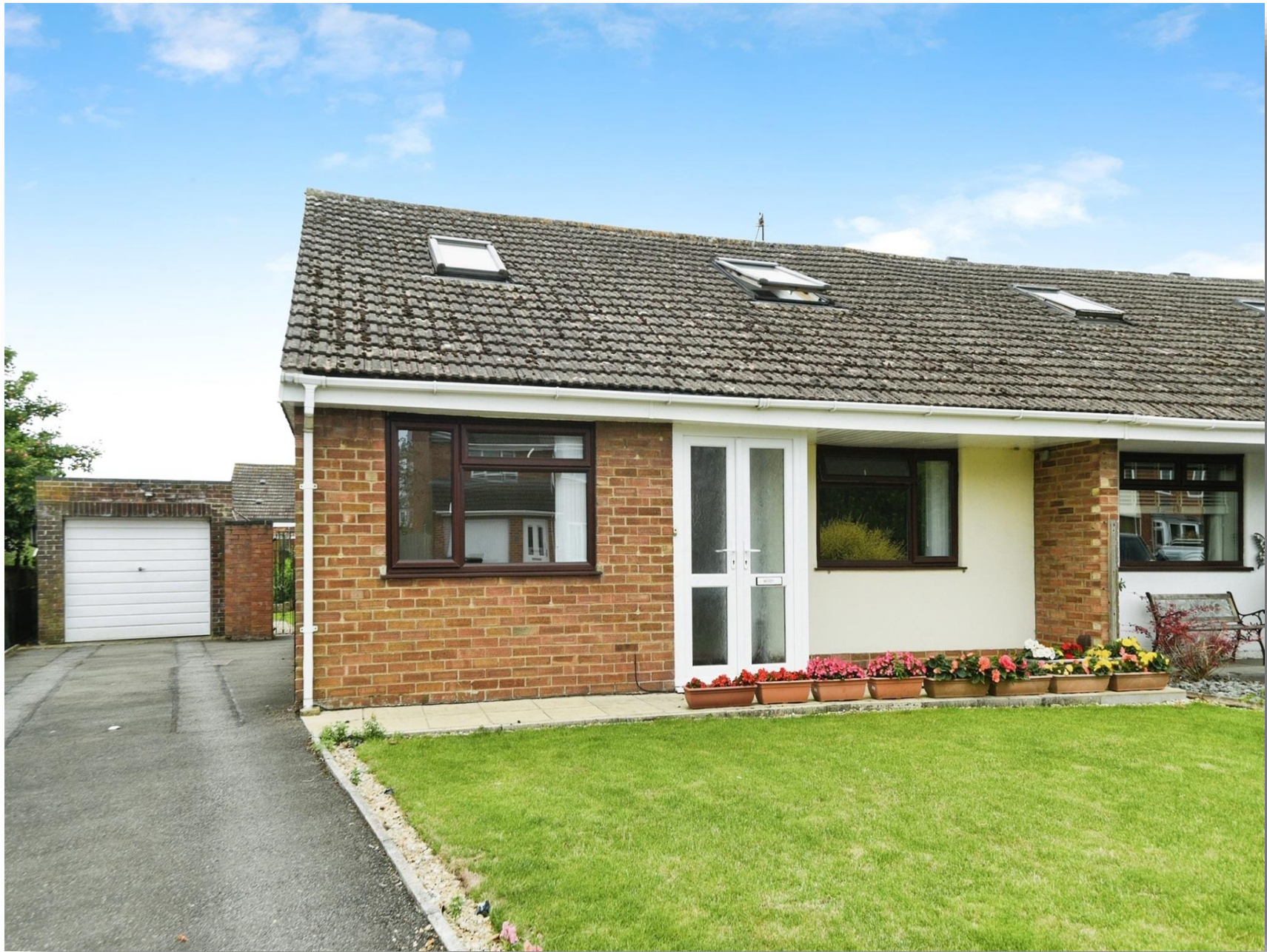
Witham Way, Swindon SN2 7NN