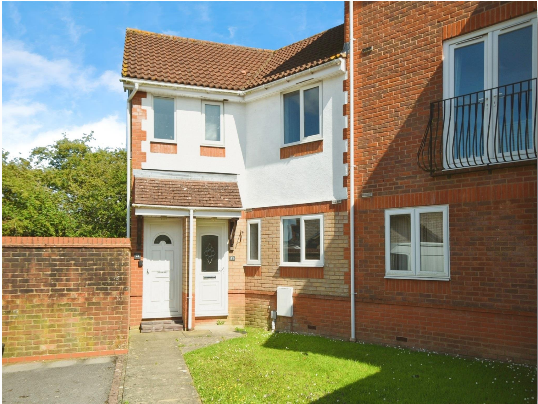
Mallard Close, Swindon SN3 5JG