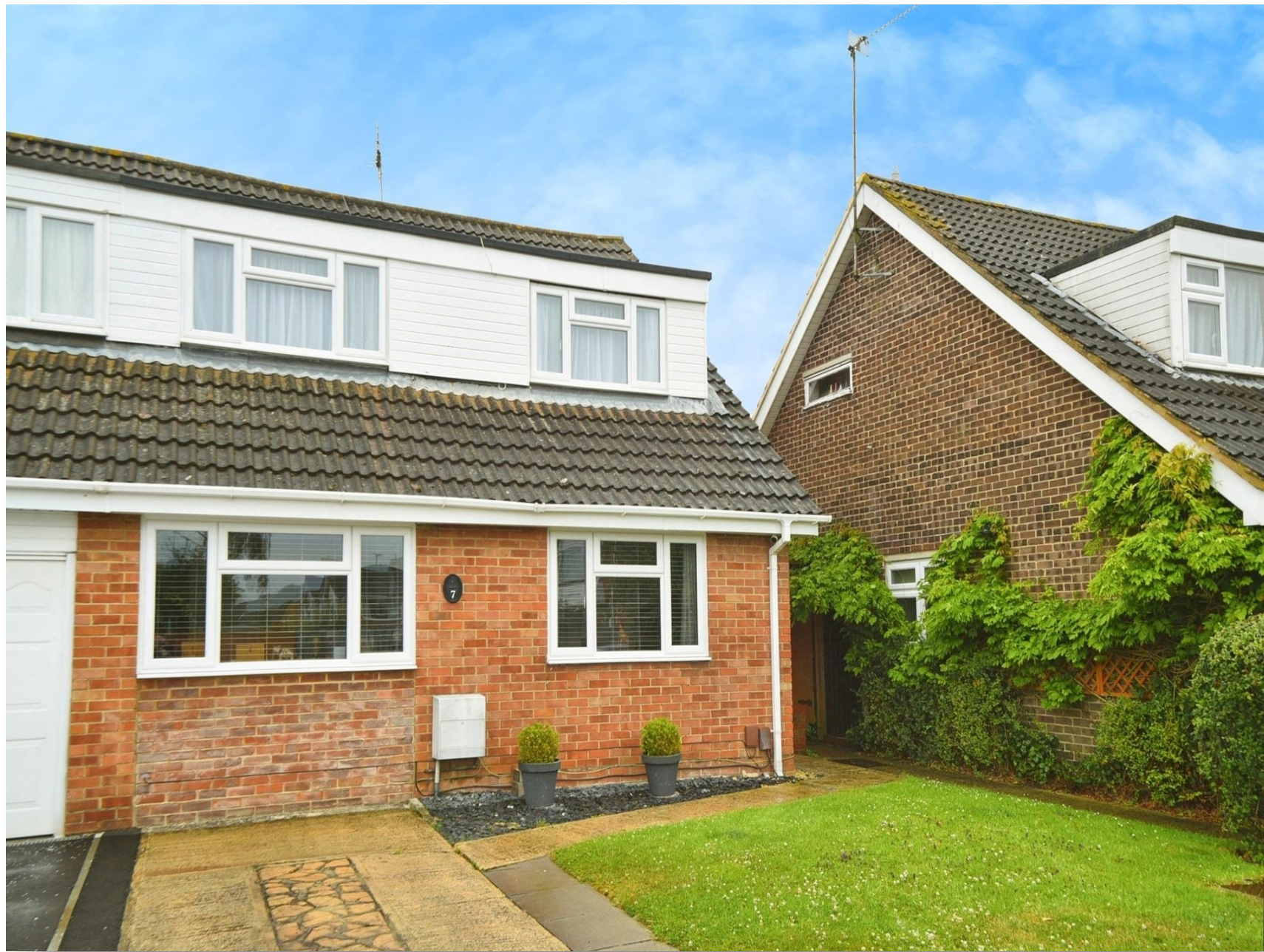
Centurion Way, Swindon SN3 4BT