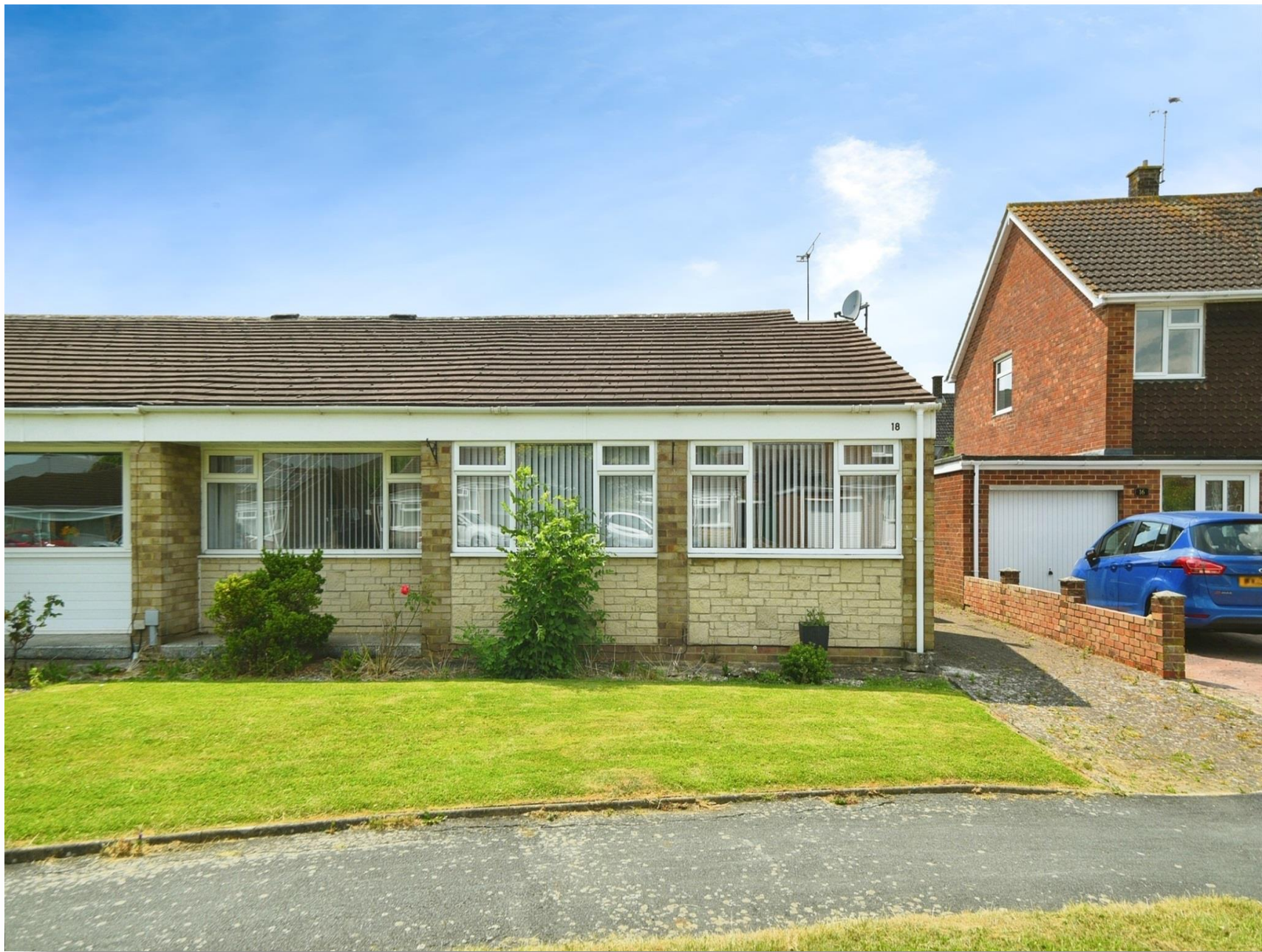
Fitzmaurice Close, Swindon SN3 5BS