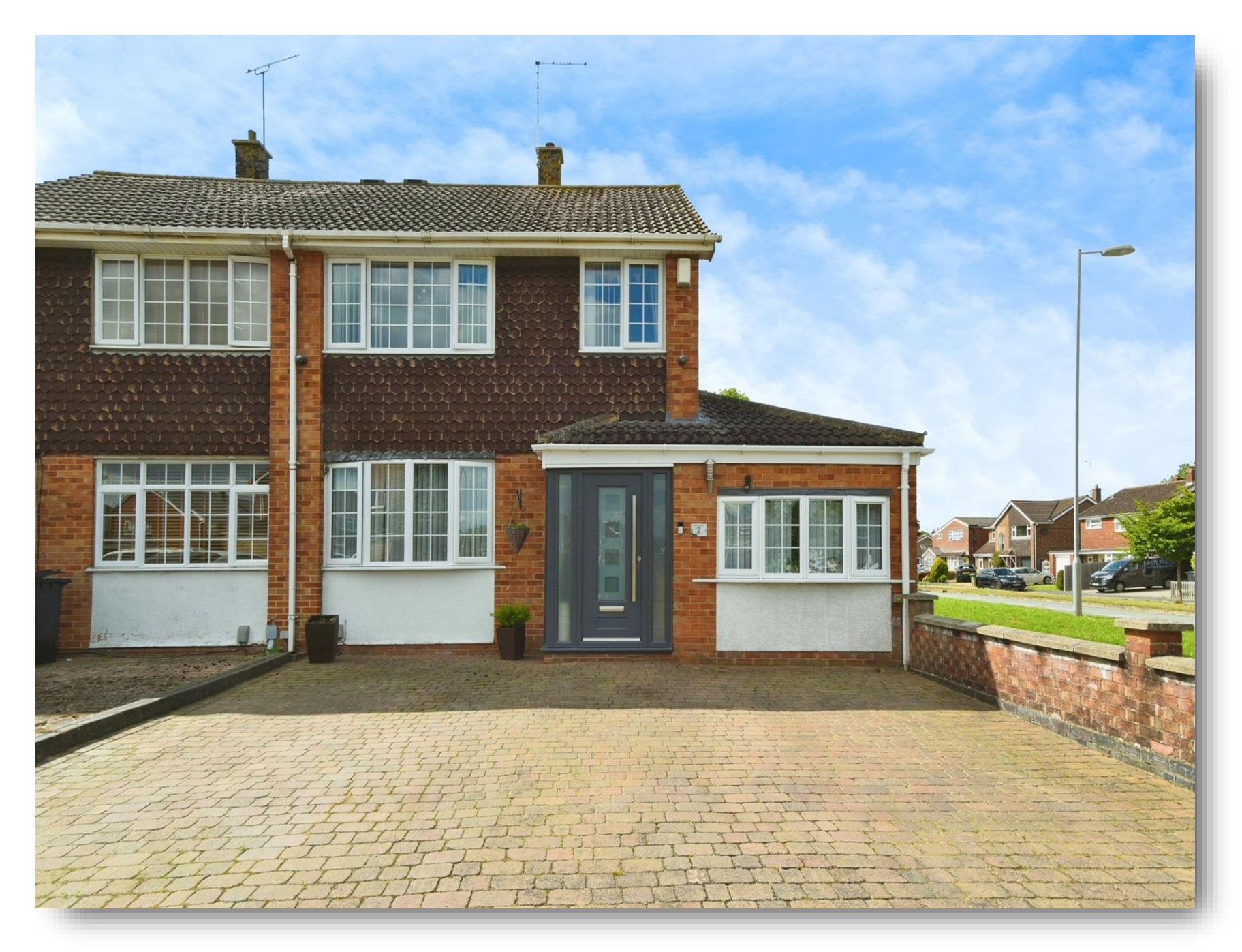
Wrenswood, Swindon SN3 5AR