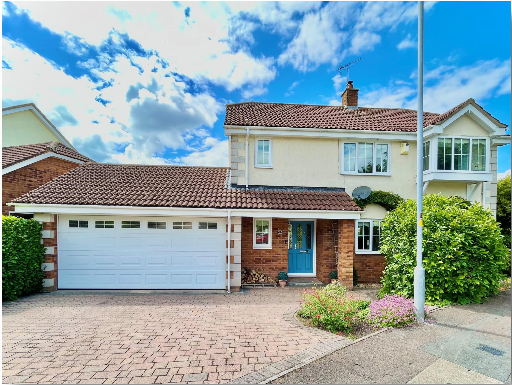
Bullfinch Close, Swindon SN3 5HP